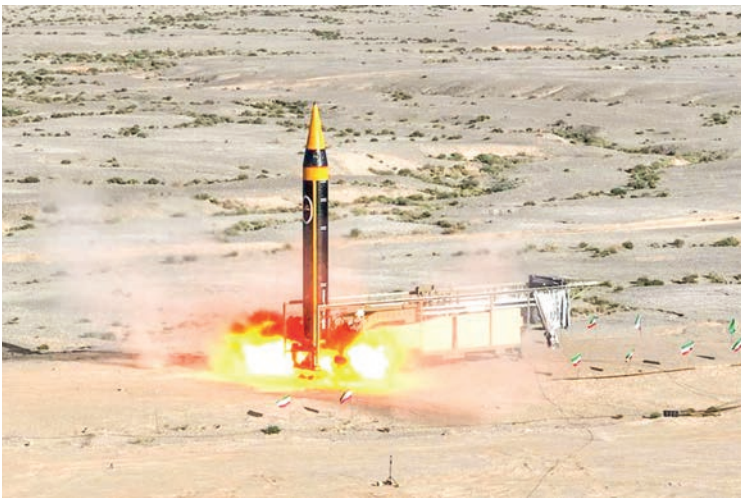
A new surface-to-surface 4th generation Khorramshahr ballistic missile called Khaibar with a range of 2,000 km is launched at an undisclosed location in Iran, in this picture obtained on 25 May 2023.

The unveiling comes amid heightened tensions in the Israeli-Palestinian conflict and just over 10 days into a fragile Gaza ceasefire that ended five days of cross border conflict between Israel and the Iran-backed Palestinian militant group Islamic Jihad.—AFP