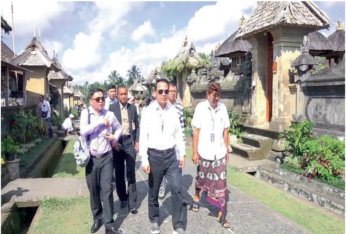
Union Minister U Maung Maung Ohn is pictured on his observation tours in Penglipuran and Kintamani villages on Bali Island yesterday (above and left below photos).

lage. It is a popular tourist destination for its preservation of the traditional customs of the Balinese. The houses and buildings in the village are built with a Bali Island traditional style and villagers are living in line with the traditional culture. The Balinese still uphold the concept of Tri Hita Karana. The Penglipuran village is one of the world's three cleanest villages. The village won many prestigious awards including the Indonesia Sustainable Tourism Award in 2017 for its cleanliness. Then, the Union minister and tour group visited the Hutan Bambu Forest near Penglipuran village. The Indonesian govern-