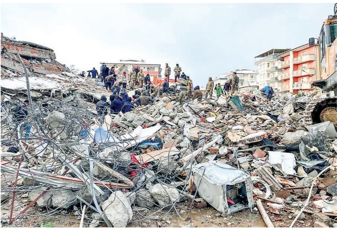
(Photo: Members of the Turkish Armed Forces conduct search and rescue efforts after the earthquake, 7 February 2023.)

Earthquakes are among the most devastating natural hazards. Türkiye’s two main fault zones