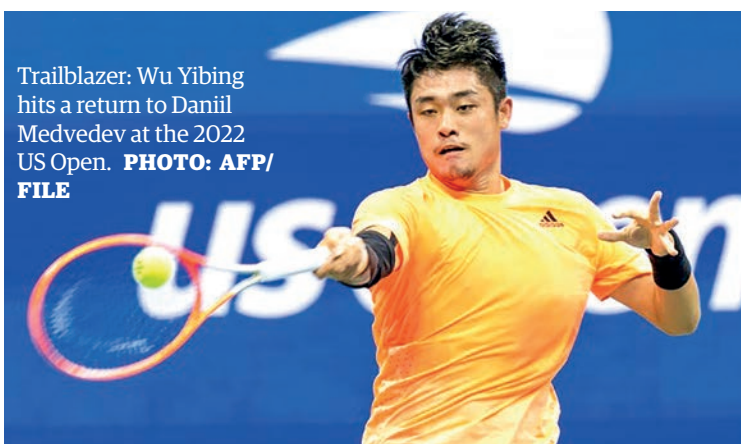
Trailblazer: Wu Yibing hits a return to Daniil Medvedev at the 2022 US Open.

Fast-forward a year and 23-year-old Wu is his country's highest-ranked male player at 59 in the world and about to spearhead a landmark assault at the French Open where it has been 86 years since a Chinese man