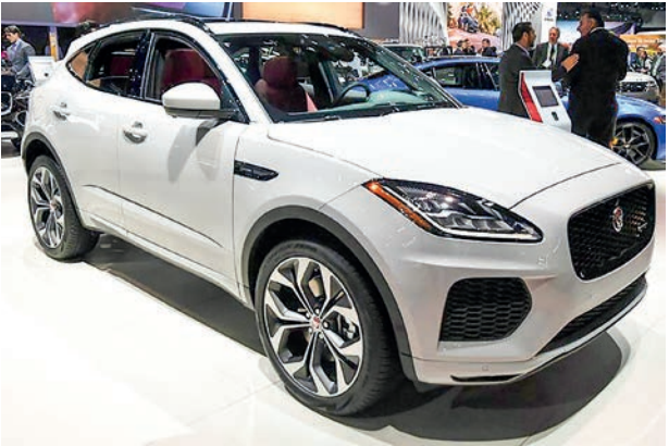
The Jaguar E-Pace is a compact luxury SUV that was introduced in 2017. It features a 2.0-litre turbocharged four-cylinder engine and is available in both all-wheel and rear-wheel drive configurations.

THE Indian owner of car-maker Jaguar Land Rover is set to select Britain over Spain to for a giant battery plant employing up to 9,000 people, the BBC reported Wednesday.