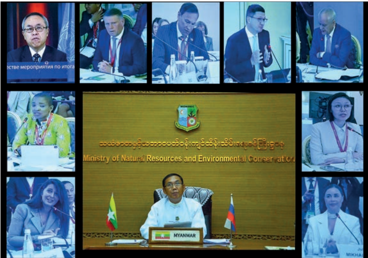
Union Minister U Khin Maung Yi joins the 10 th Nevsky International Ecological Congress virtually.

In the discussion, the Union minister said that Myanmar is a country rich in water resources, owning 12 per cent of Asia’s