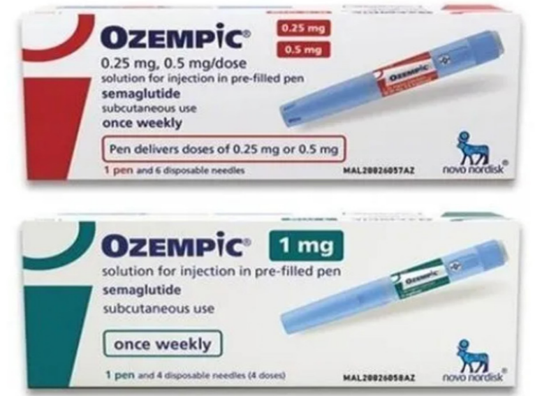
Novo Nordisk’s Ozempic is a once-weekly injectable medication used to treat type 2 diabetes. ILLUSTRATION FOR VISUAL PURPOSE/ MIMS/AFP