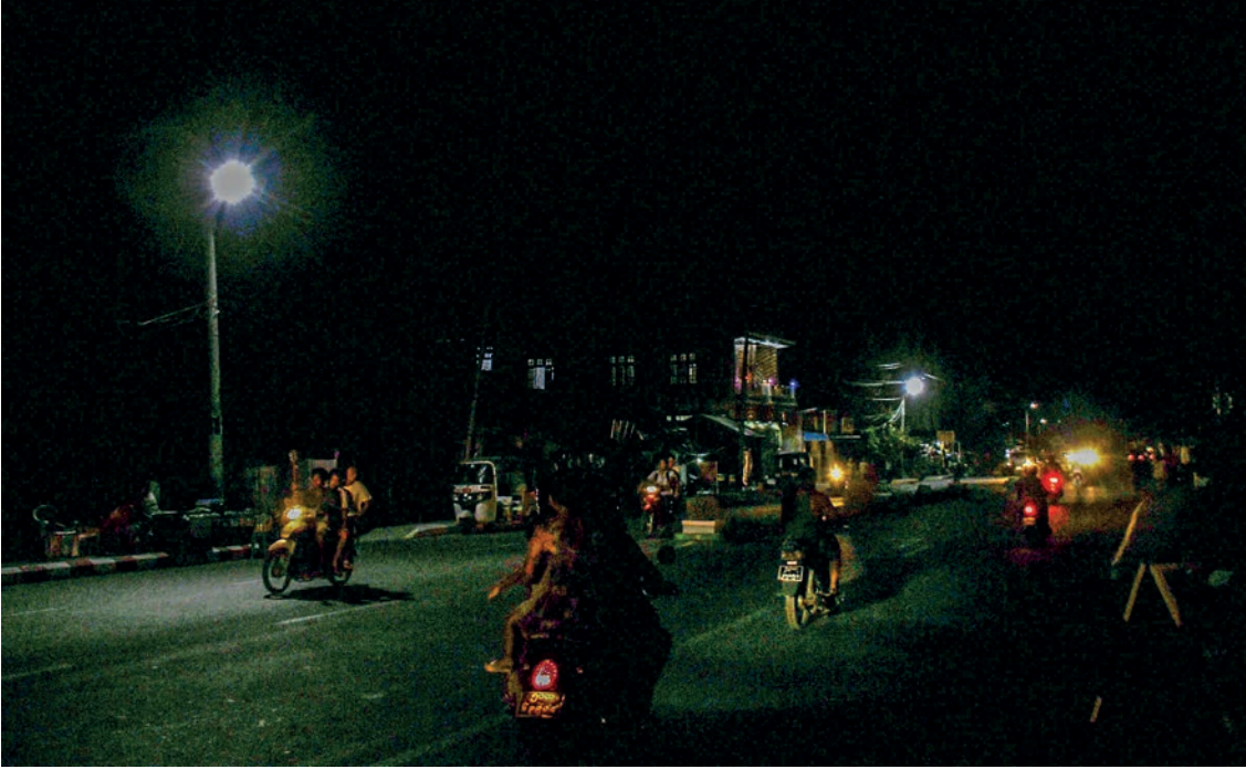
Lampposts resume streetlights in Sittway.

Starting 25 May, the lamp posts will be illuminated between 7 pm and 10 pm at the Sittway bus terminal-Meesetgyi roundabout, Meesetgyi roundabout-clock-tower, clock-tower-Biluma bridge and Biluma bridge-Setyokya bridge. Moreover, the charging points will be designated at the bus terminal, Meesetgyi roundabout, in front of the state government office, cultural museum and Biluma bridge for the people to charge phones, electric bulbs and batteries.— MNA/KTZH