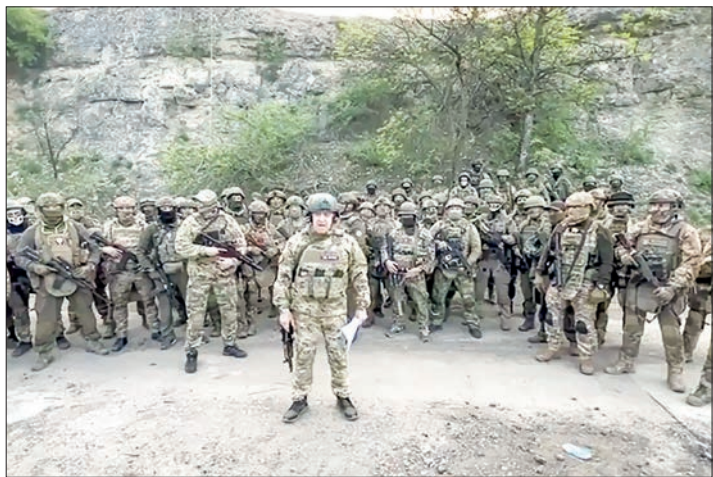
Wagner, a private military group from Russia, is moving away from a city in Ukraine and giving the area to the Russian military.

THE head of Russia's Wagner mercenary group said on Thursday his troops had started transferring their positions in the flashpoint eastern