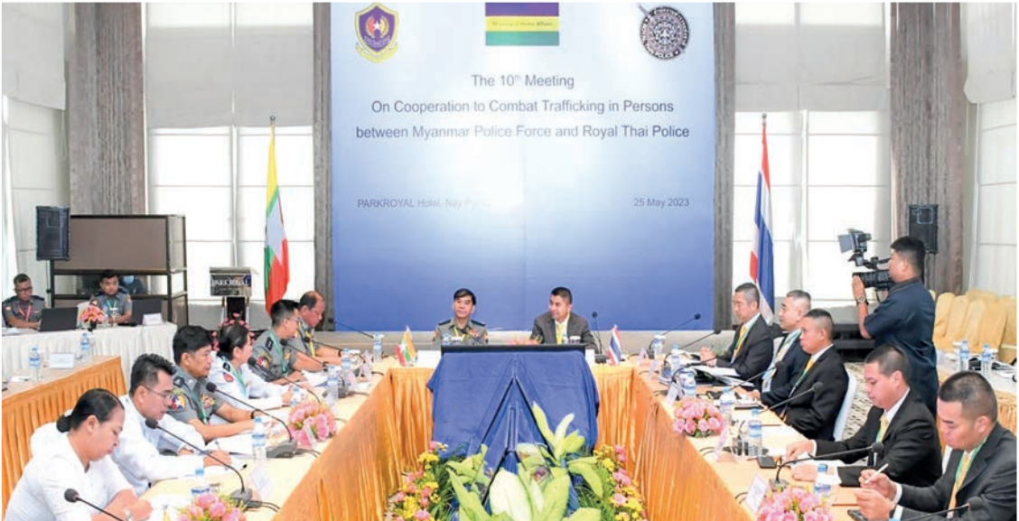
The Tenth Meeting on Cooperation to Combat Trafficking in Persons between the Myanmar Police Force and Royal Thai Police in Nay Pyi Taw yesterday.

THE 10 th Meeting on Cooperation to Combat Trafficking in Persons between the Myanmar Police Force and Royal Thai Police was held at Park Royal Hotel in Nay Pyi Taw yesterday. The meeting was attended by MPF Deputy Chief of Police Police Maj-Gen Aung Aung and representatives and RTP Deputy Police Chief Police General Surachate Hakparn and representatives. Both sides discussed and exchanged views on the implementation of the resolutions of the 9th meeting between the Myanmar Police Force and the Royal Thai Police on anti-human trafficking cooperation in the 2019 meeting held in Thailand, situations of trans-border human trafficking problems, human trafficking preventive measures and changing patterns of human trafficking, processes of foreigners illegally coming to work in Myanmar's border towns, suspects of human trafficking in Thailand, arrest and hand over the absconding defendants who have been prosecuted under the Foreign Employment Law and joint prevention and protection of illegal entry and exit along the Myanmar-Thailand border. — MNA/TS