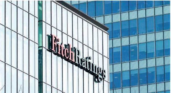
Ratings agency Fitch is a global credit rating agency that provides credit ratings and research for debt securities, including corporate debt, government debt, and structured finance securities. It also provides research and analysis on national economies and their respective creditworthiness.

President Joe Biden has been involved in months of tense talks with the Republican opposition in Congress, who have said they will agree to raise the borrowing limit only in exchange for significant spending cuts.—AFP