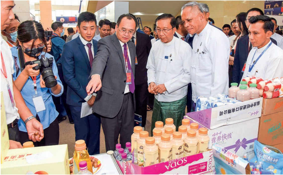
The Deputy Prime Minister, the Lancang Mayor and dignitaries look into the Chinese products at the event yesterday.

Union Minister for Commerce U Aung Naing Oo also called for Myanmar and Chinese businesspersons to strive for regional development by effectively applying the trade fair platform as it is an important trade fair for business cooperation and the development of both sides.