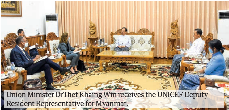
Union Minister Dr Thet Khaing Win receives the UNICEF Deputy Resident Representative for Myanmar.