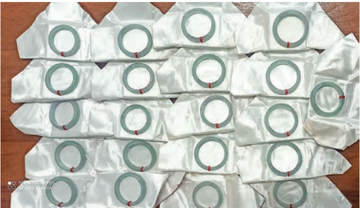
Confiscated illegal commodities at Yangon International Airport.

Desk) on 23 May. A total of 21 pieces of jade bracelets worth K2.1 million was seized. A combined team seized three kinds of goods (worth K9,362,488) including 13,920 pairs of Lotus shower sandals that exceeded the ID from a Hino Profia lorry (estimated value of K30 million) heading from Myawady to Yangon near the Phayagyi tollgate on 23 May. On the same day, a combined team composed of members of the Myoma Police Station in Sagaing Township captured a Hijet car (estimated value of K7.5 million) without official documents at the Yadanabon combined checkpoint. The action was taken under the Export and Import Law. Afterwards, a total of 1.684 tonnes of illegal teak (worth K846,384) was captured in the Thayawady district on the same day. Therefore, 15 arrests (estimated value of K229,127,439) were made on 18 and 23 May, according to the Illegal Trade Eradication Steering Committee. — MNA/MKKS