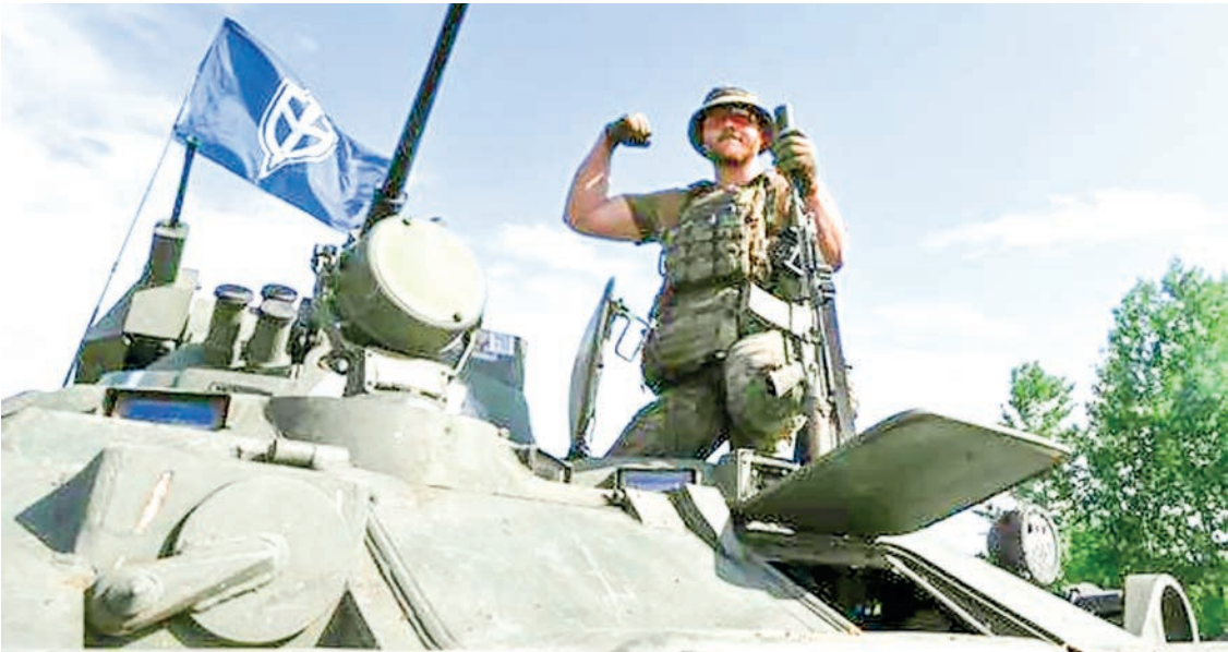
The alleged perpetrators of the incursion gave interviews to Ukrainian media on Wednesday.

RUSSIA threatened Kyiv on Wednesday it would respond “extremely” harshly to all future incursions, after Moscow deployed jets and artillery to fight off an armed group that crossed over from Ukraine. As Russia took stock following the most serious attack on its soil since Moscow’s offensive in