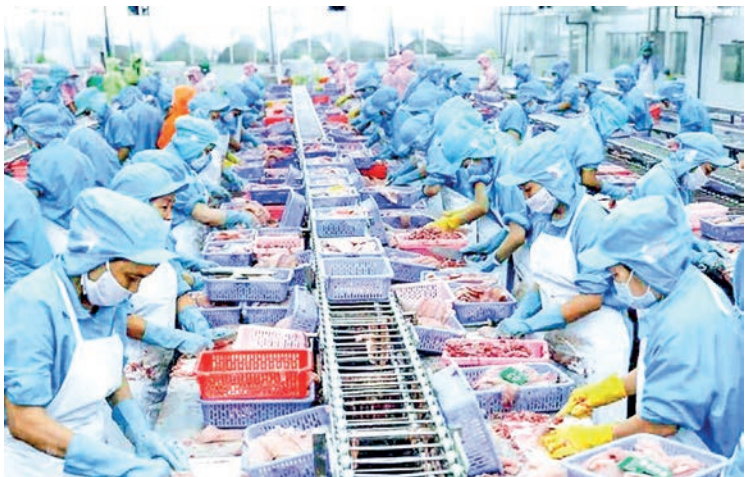
The photo shows the processing line of fishery products.

MORE than US$40.98 million was earned from the export of fishery products between 1 April and 12 May of the 2023–2024 financial year, according to statistics of the Ministry of Commerce. Fishery products from Myanmar are exported to foreign countries through normal trade and border trade channels. Although the export of fishery products is being carried out as normal, the export has not returned to the status of the pre-Covid period. Over $64.07 million was collected from the export of fishery products in the same period of the last financial year. Fishery products such as fish, shrimp, and crab are regularly exported to China, Thailand, and other neighbouring countries through border trade posts in Muse, Myawady, Kawthoung, Sittway, Myeik, and Maungdaw. In addition to 480,000 fish and shrimp farms, there are more than 120 cold storage facilities across Myanmar, and over 20 kinds of fish such as Illish, Barramundi, Rohu, Swamp Barb, and Gagata gagata are being exported. — TWA/CT