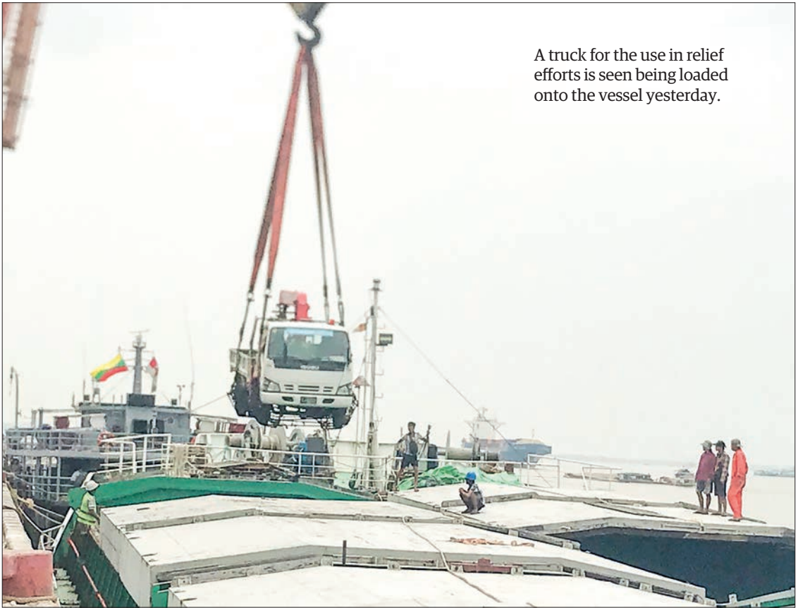
A truck for the use in relief efforts is seen being loaded onto the vessel yesterday.