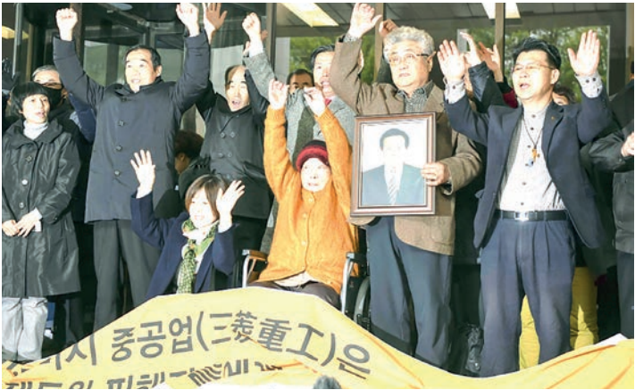
File photo taken in Seoul, South Korea, in November 2018 shows a group which includes Korean plaintiffs of a 2018 South Korean Supreme Court ruling that ordered compensation from a Japanese company over forced labour during Japan’s 1910-1945 colonial rule of the Korean Peninsula.

pensation from the Japanese government but until now, none had accepted payment from the foundation. Announced in March by Seoul to settle the wartime labor dispute and help improve ties with Japan, the foundation has seen backlash from the South Korean public.—Kyodo