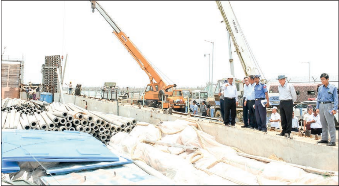
Deputy Prime Minister Admiral Tin Aung San inspects the arrival of relief supplies at Sittway Port yesterday.

The Deputy Prime Minister and party went to Sittway Port and Phaungtawgyi Jetty of the Myanma Port Authority and inspected the loading processes of relief items and materials onto the boats/vessels from Sun Shine, Fortune and Khine Yazar ships and gave words of encour-