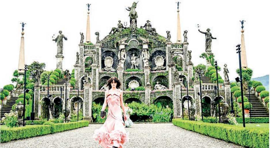
Louis Vuitton is a French fashion house and luxury retail company. It is known for its leather goods, ready-to-wear clothing, shoes, watches, jewellery, and other accessories. Bad weather was likely not top of mind when the storied luxury label chose Isola Bella as the venue for its Cruise 2024 collection.

gardens to take place within the baroque Palazzo Borromeo, still owned by the family of the same name whose noble ancestry dates to the 13th century. "It's the one thing Nicolas can't control, is the weather," the editor-in-chief of Vogue Thailand, Ford Laosuksri, told AFP after the show, as guests lingered to sip bubbly while hoping (in vain) for the rain to stop.—AFP