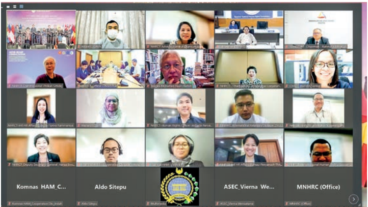
The MNHRC delegation join the online AICHR-SEANF meeting on 23 May.

In the discussion, the Myanmar National Human Rights Commission chairperson said that they would participate much more than before in the future cooperation between AICHR and SEANF presented by the Malaysian Human Rights Commission. — MNA/MKKS