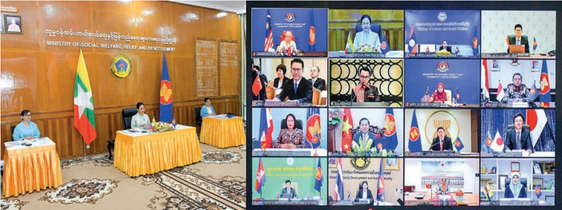
Union Minister Dr Thet Thet Khine virtually participates in the 11 th AMMSWD Meeting and the 7 th AMMSWD plus 3 yesterday.

UNION Minister for Social Welfare, Relief and Resettlement Dr Thet Thet Khine attended the 11 th ASEAN Ministerial Meeting on Social Welfare and Development and the 7 th ASEAN Plus Three Ministerial Meeting on Social Welfare and Develop-