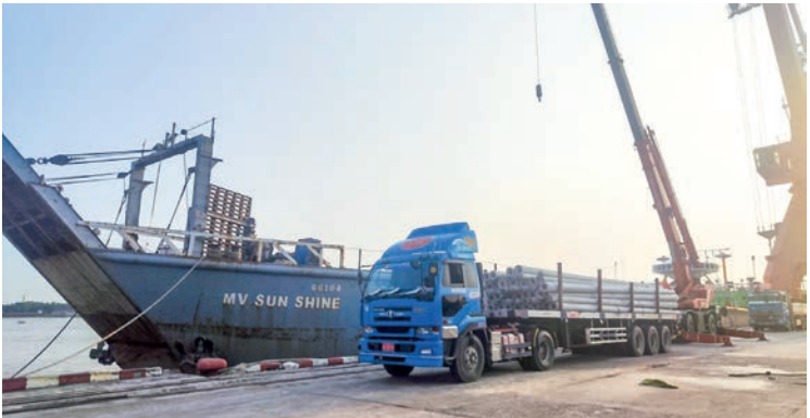
Photos show the arrivals of relief goods in Sittway.