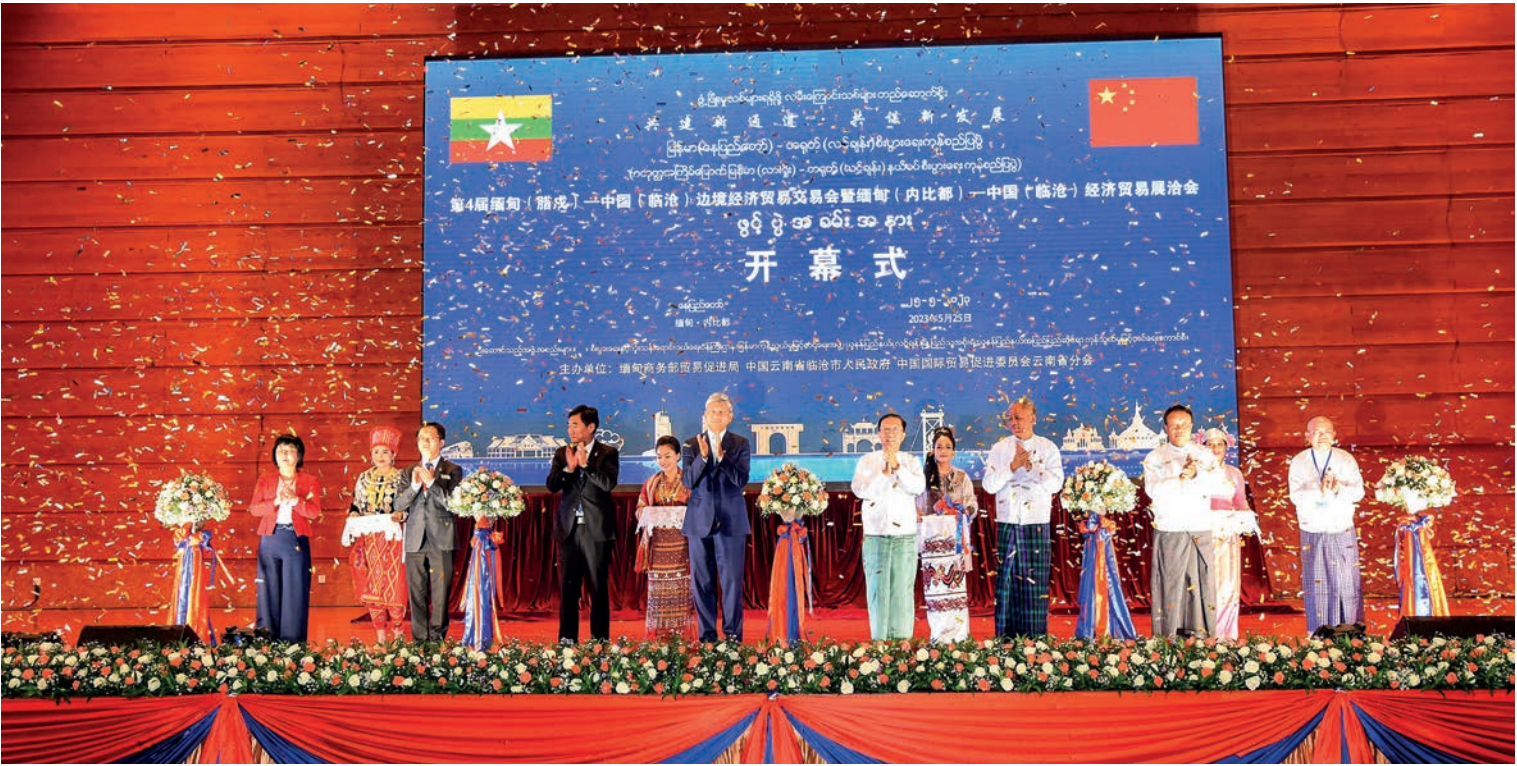
The inaugural event of the Myanmar (Nay Pyi Taw)-China (Lancang) Trade Fair (Fourth Myanmar (Lashio)-China (Lancang) Border Trade Fair) in progress yesterday.

Chinese Ambassador to Myanmar Mr Chan Hai underscored that Myanmar is the largest trade partner of Yunnan Province as well as the largest import source and export market. Economic cooperation between Yunnan Province and Myanmar is a geographically strong point and a firm foundation. At present, the promotion of economic cooperation is a common goal for them as well as the basic interests of people from both sides. China wishes to support Myanmar in deepening fraternal cooperation and assist in peace, stability and development of Myanmar.