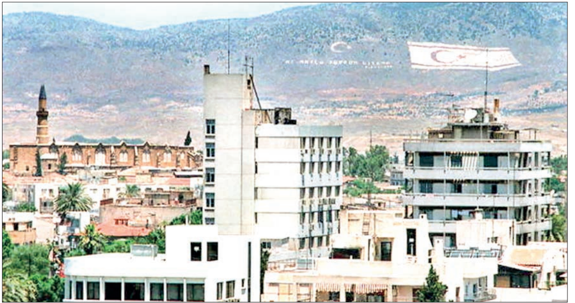
A general view of Nicosia - the world's last divided capital - with the stark contrast between the high-rise buildings which litter the Greek side and the low buildings across the green line on the Turkish side of the city.

Line", secured with razor wire and sandbags, has since cut