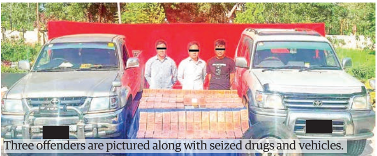
Three offenders are pictured along with seized drugs and vehicles.

billion that was to be carried from Mongyai township in Shan State (North) to Pekhon township in Shan State (South). The police have taken legal action against the offenders and an investigation is underway to identify the perpetrators of the crime chain.