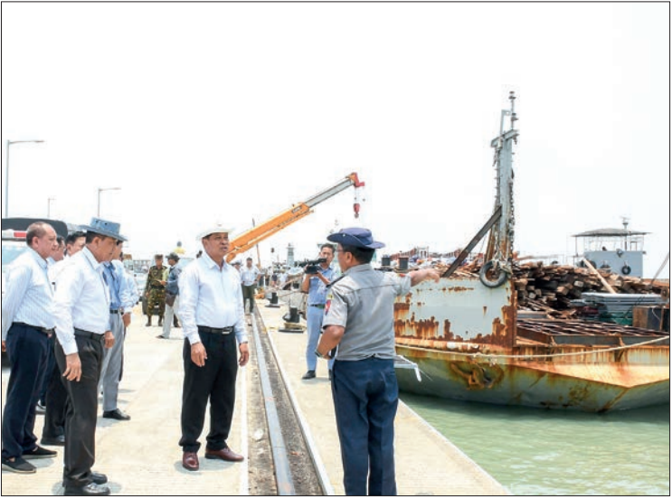
The Deputy Prime Minister views the arrivals of relief goods in Sittway (top and above photos).