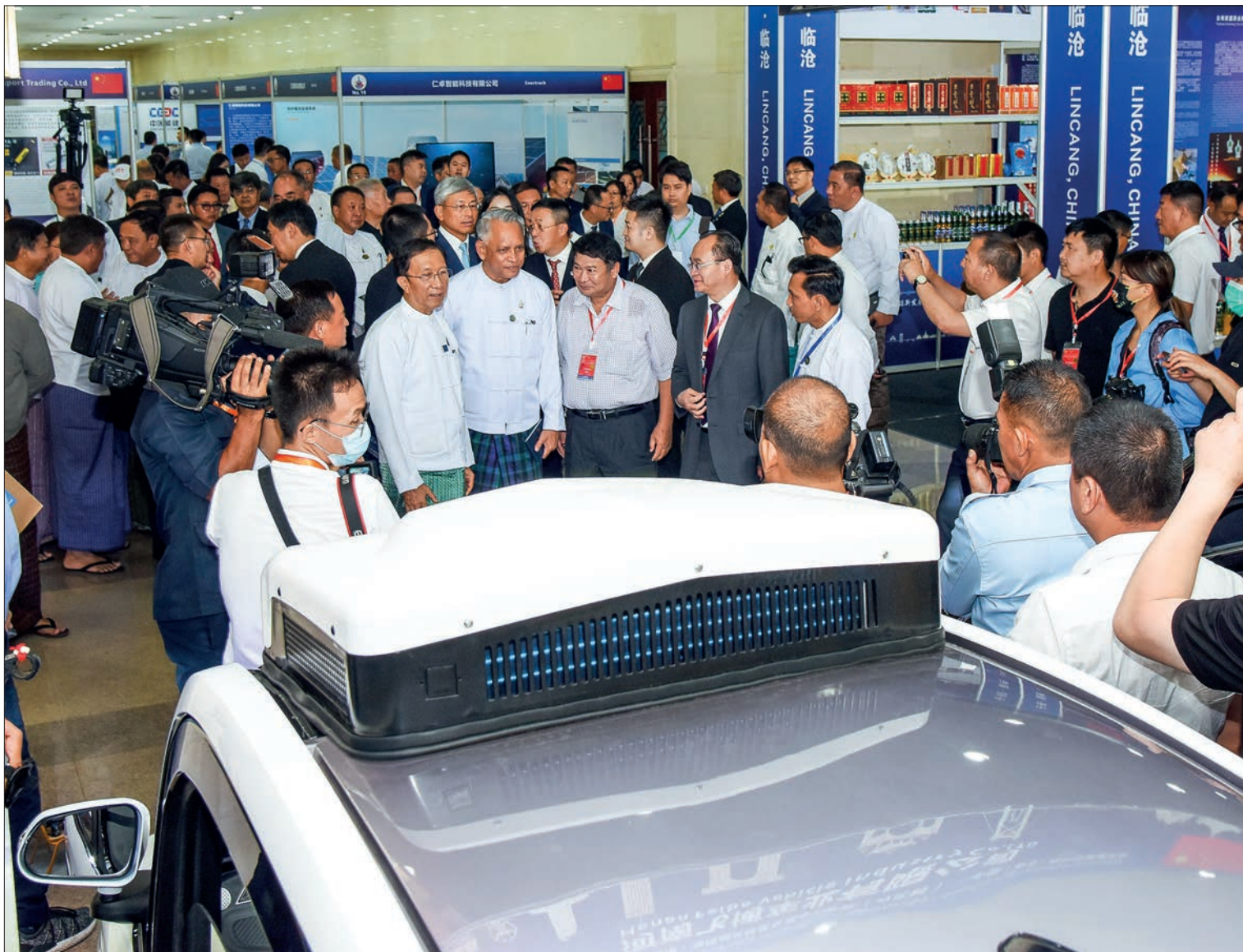
Deputy Prime Minister Union Minister for Planning and Finance U Win Shein, Union Commerce Minister U Aung Naing Oo and dignitaries view round the booths at the Myanmar (Nay Pyi Taw)-China (Lancang) Trade Fair in Nay Pyi Taw yesterday.

As the wide export of Myanmar's main products to the Chinese market is of importance in promoting bilateral trade, China needs to necessarily coordinate regional agreements as well as ease restrictions for Myanmar products to have more market shares, said Deputy Prime Minister Union Minister for Planning and Finance U Win