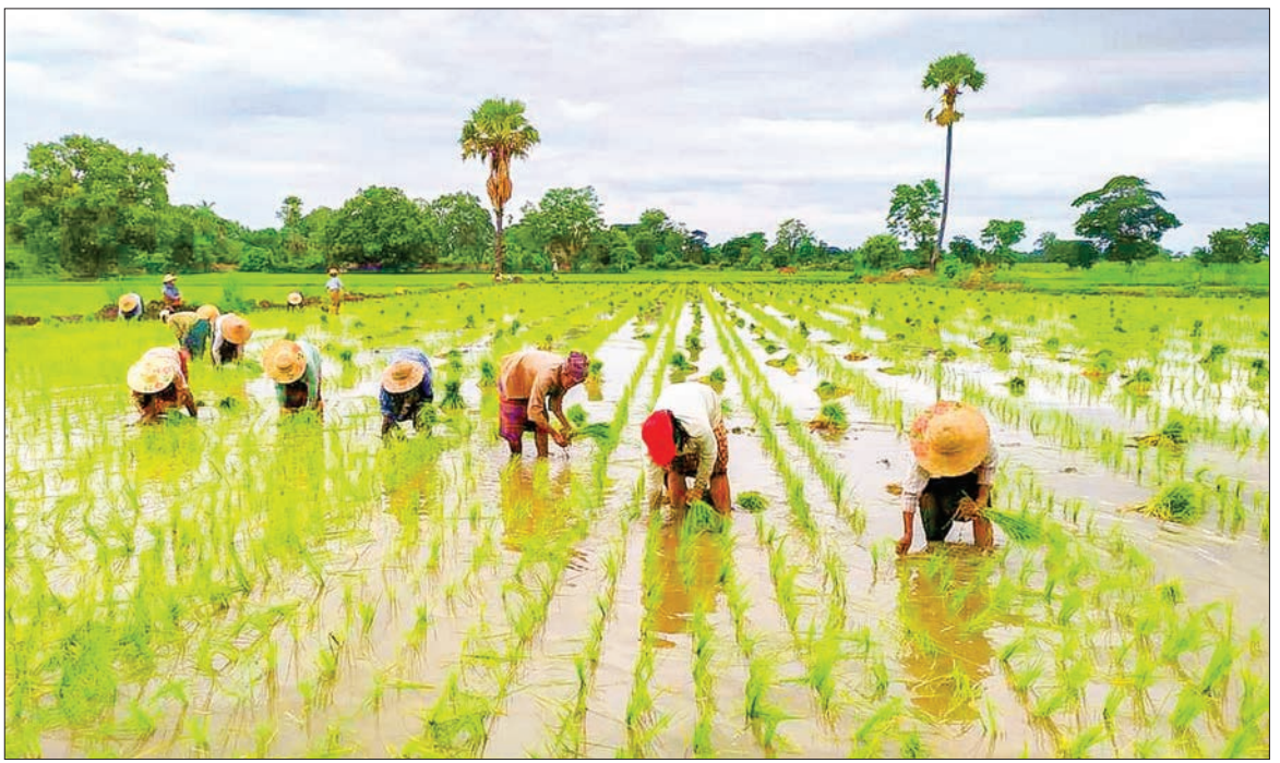
Farmer are planting paddy in rain-fed field in Minbu.

at the country, regional and global levels, as data collection processes have been disrupted by physical distancing measures to contain the pandemic. For instance, FAO has recently released the FAO Data Lab to bring real time data on food prices and sentiment analysis. We have also developed the Hand-in-Hand Geospatial Platform which brings more than 1 million geospatial layers to help prioritize interventions within countries. Second, we must dramatically