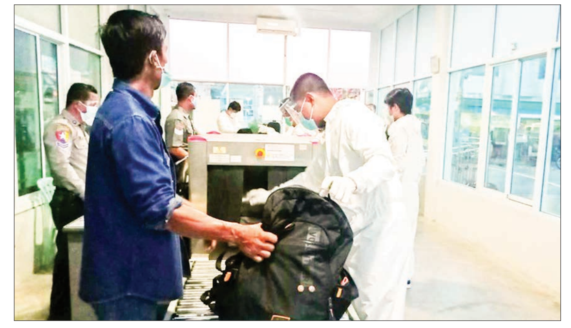
Seamen signed off from the ships in the Andaman Sea undergo hotel quarantine in Kawthoung.