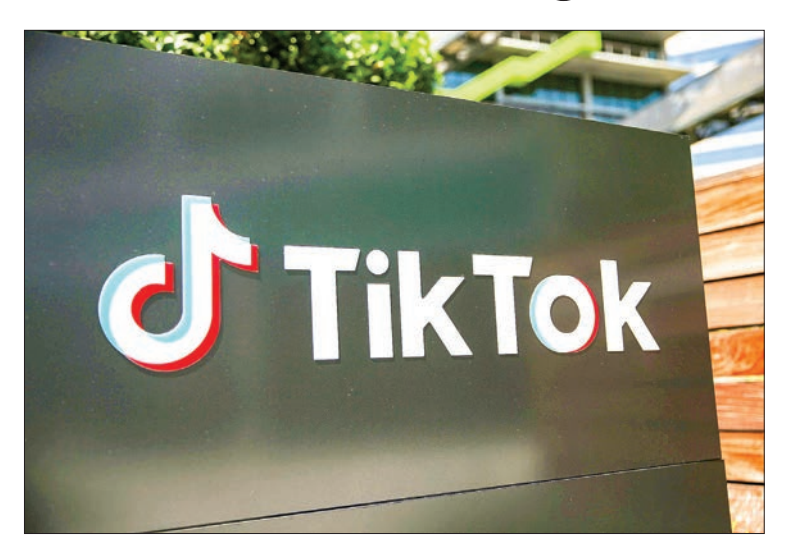
(FILES) In this file photo taken on 27 August 2020, The TikTok logo is displayed outside a TikTok office on in Culver City, California.