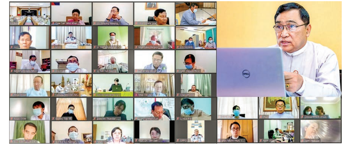
Union Minister Dr Win Myat Aye presides over the coordination meeting with National Committee on Rights of Child via videoconference on 14 September 2020.

In his opening remarks, the Union Minister explained the formation of management committees, work committees and technical teams for the emergence of Early Childhood Intervention (ECI) services for prompting the rights of children; the ECI pilot project is being im-