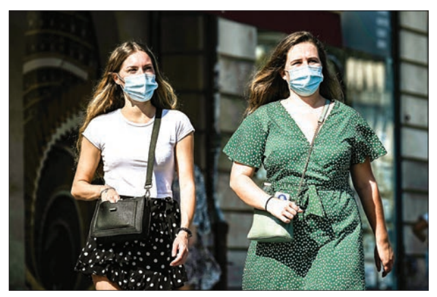
Pedestrians wearing protective face masks due to the COVID-19 disease caused by the novel coronavirus, walk in a street of Bordeaux, southwestern France, on 14 September 2020.

COPENHAGEN (Denmark) — The World Health Organization expects Europe to see a rise in the daily number of Covid-19 deaths in October and November, the head of the body's European branch told AFP.