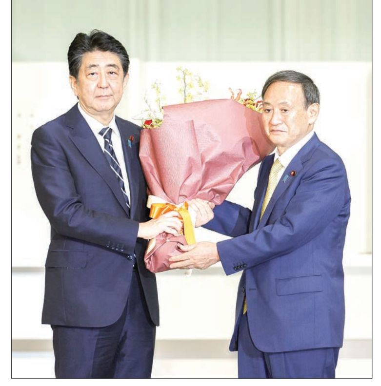
Outgoing Japanese Prime Minister Shinzo Abe (L) and Chief Cabinet Secretary Yoshihide Suga pose for a photo after the Liberal Democratic Party's presidential election to choose Abe's successor in Tokyo on 14 September 2020.

A total of 394 ballots were given to LDP lawmakers and 141 to delegates of local chapters, while the party's rank-and-file members were excluded from the vote this time to speed up the process amid the coronavirus pandemic. Suga secured his win among the local chapters' votes as well after most of them held primaries, with each chapter deciding whether to give all three allotted ballots to a single candidate or to multiple candidates in proportion to primary results.