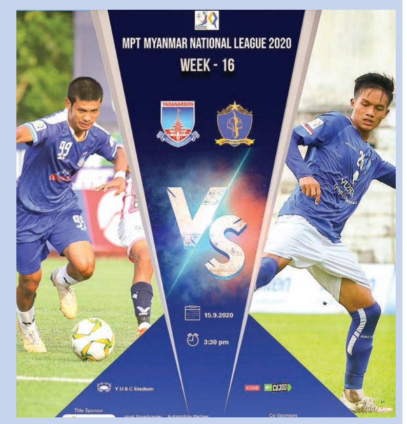
Yadanarbon FC and Southern Myanmar FC will meet in Week-16 of MPT MNL 2020 at the Yangon United Sports Complex on 15 September 2020.

place with 29 points, Shan United in the fourth place with the same points, followed by Rakhine United in the fifth place with 17 points.