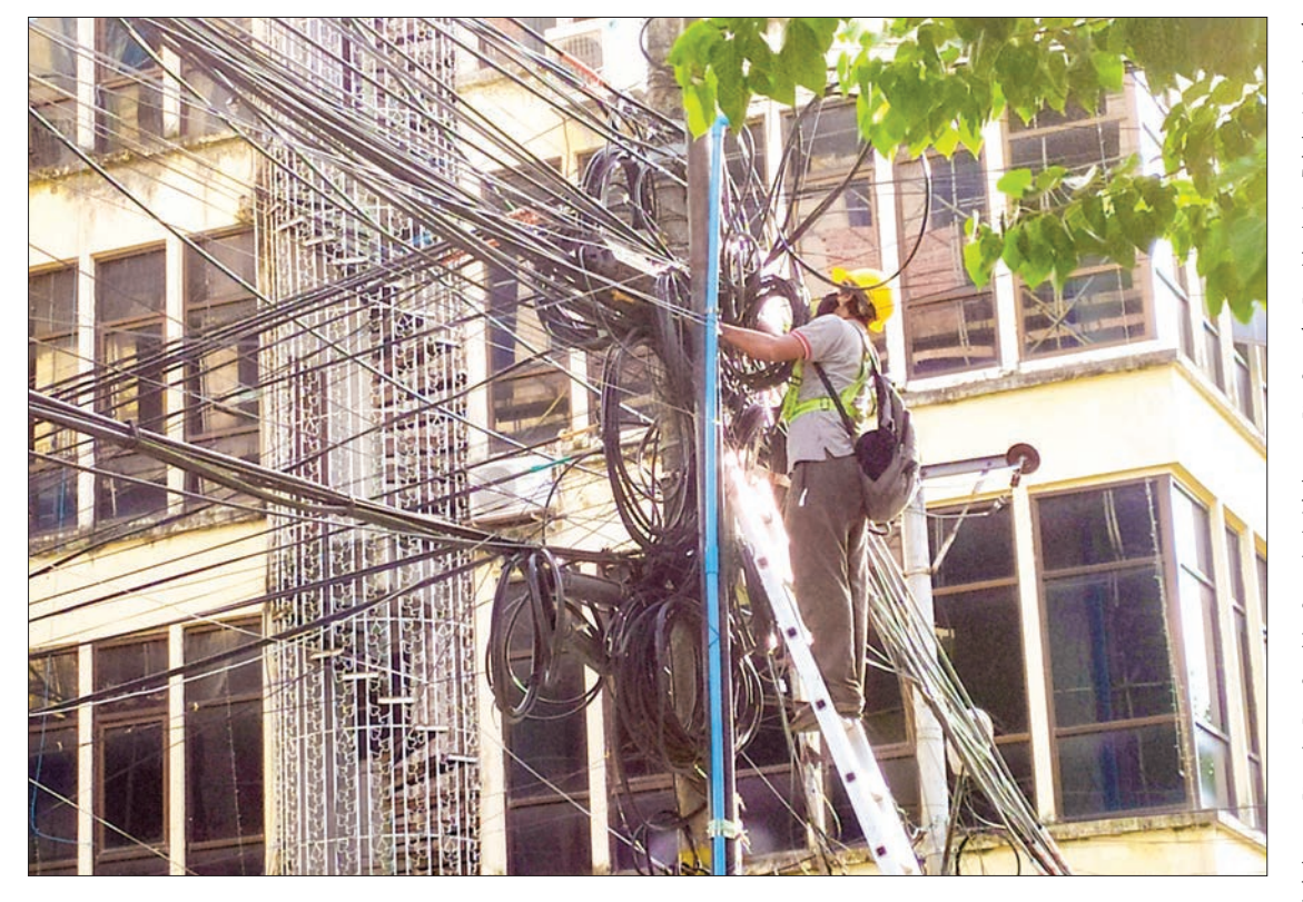
A man carries out maintenance of internet cables at a street lamp post in Yangon on 3 September 2020.

THE coronavirus pandemic has made the fibre-optic market stronger, and the fibre internet usage has remarkably surged in Myanmar, internet service providers in Myanmar said. "Mobile internet usage had