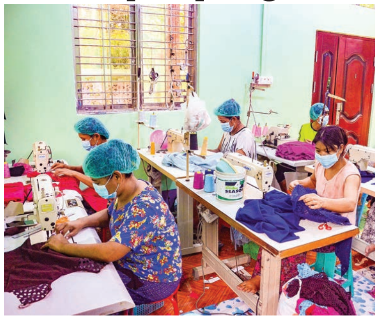
A woman sewing on the production line in a garment factory in Yangon.

Covid-19 badly battered the labour-intensive enterprises, said an official of the Directorate of Investment and Company Administration.