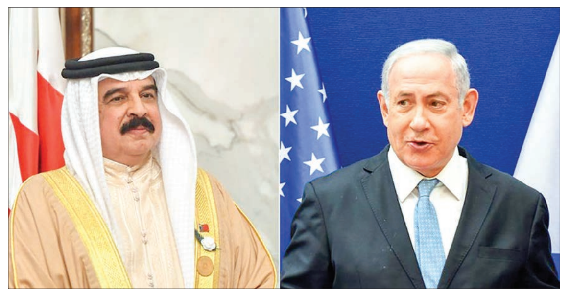
Bahrain on Friday became Saudi Arabia's second Gulf ally to announce plans to formalize relations with Israel over the past month, after the United Arab Emirates' landmark agreement.

RIYADH, Saudi Arabia — Bahrain's move to formally establish relations with Israel could not have happened without Saudi Arabia's green light, another step in what observers call Riyadh's "alternative normaliza-