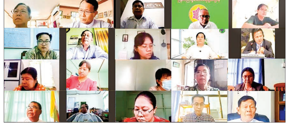
Officials from the Ministry of Social Welfare, Relief and Resettlement discuss providing cash assistance for PWDs via videoconference on 13 September 2020.

She said that Social Welfare Department has negotiated with Rehabilitation Department by sending the lists of those who have not yet received get cash assistance and that providing cash assistance for PWDs would be effective if cooperated by My-