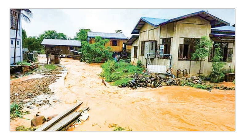
A street flooded by heavy rain in Wuntho Township, Sagaing Region on 13 September 2020.

"Seven miles from Wuntho and three miles from Kawlin are still flooded, and roads and some places could not be accessible. The fire brigade is monitoring the situation to provide necessary assistance", said U Kyaw Myo Thu, Head of Wuntho