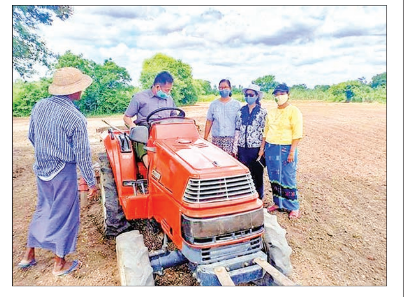
A machine planter can cultivate 1 to 1.5 acres of sesame field an hour.