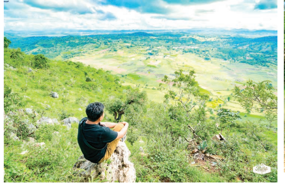
Mway Taw Taung View Point