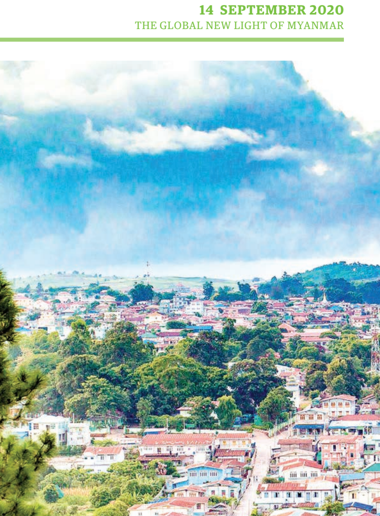
Aungban, trade town

A unique crop of Aungban is potato. The potatoes and the potato chips of Aungban are still