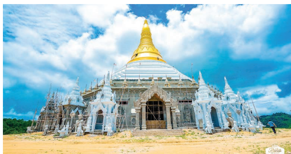
Taya Shint Taung Pagoda which can be seen from across Aungban.