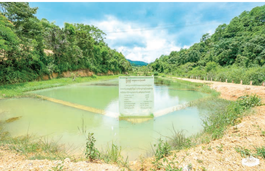
"Yay Htwat Oo", source of water which provide water for 400 monks at the monastery at first and the water is even enough now for Aungban.