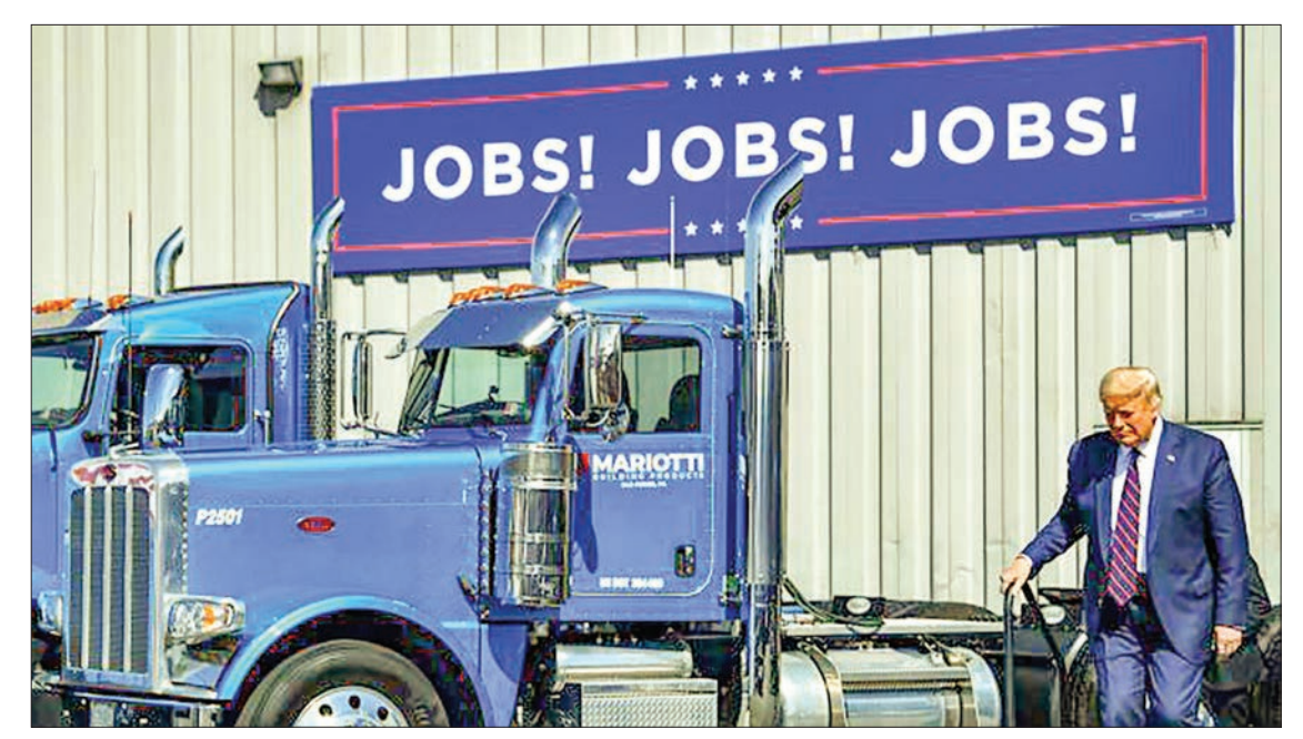
The fall in the unemployment rate has removed some of the pressure on Republicans on Capitol Hill, and Trump administration officials, to strike a deal.