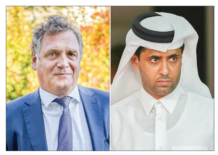
Jerome Valcke (left) and Nasser Al-Khelaifi go on trial in Switzerland on Monday.

ZURICH — FIFA's disgraced former secretary general Jerome Valcke and Paris Saint-Germain chief Nasser Al-Khelaifi go on trial in Switzerland on Monday in the latest chapter of football's seemingly endless corruption