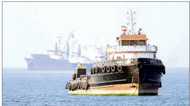
The Iran-flagged tugboat Basim sails near a ship anchored in the Strait of Hormuz off Bandar Abbas in southern Iran.

sage requests must be submitted exclusively through its website and email address, and must include vessels' "valid and accessible" contact information.