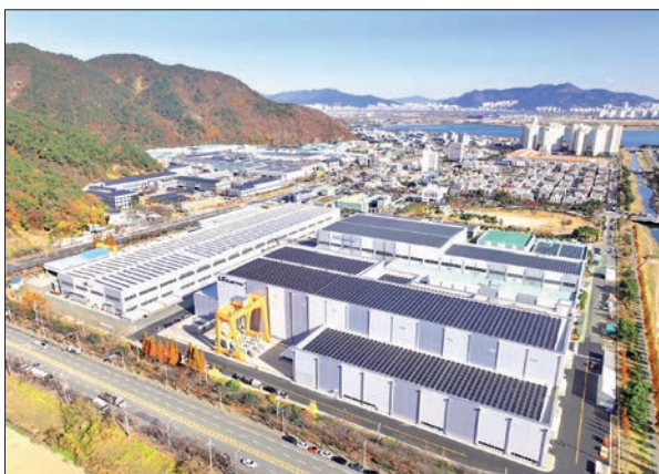
The report highlighted India’s growing role in the global data centre industry.

INDIA’S energy sector is demonstrating resilience