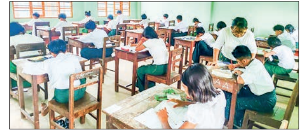
Out-of-school children sit for the standard placement examination.

THE Placement Test (Special Programme) in Pakokku Township, Magway Region, began on 15 June, and students completed the Science subject on 20 June, the final day of the examination.