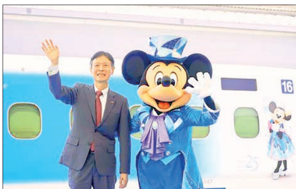
A Disney-themed bullet train began running Friday on the Tokaido Shinkansen Line connecting Tokyo and Shin-Osaka stations to mark Tokyo DisneySea's 25 th anniversary.

The 16-car N700A set features a "jubilee blue" livery to celebrate the theme park's anniversary, adorned with