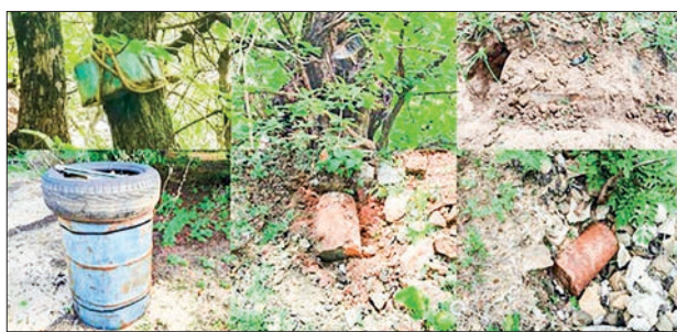
Mine clearance underway as 20 additional devices are detonated along the Kanma-Myaing Road.

ACCORDING to the information from duty conscientious residents, security forces conduct mine clearance activities along Kanma-Myaing road in Pakokku Township as PDF terrorists plant land mines made of oil barrels in the pits on the road, intending that people face difficulties in travelling.