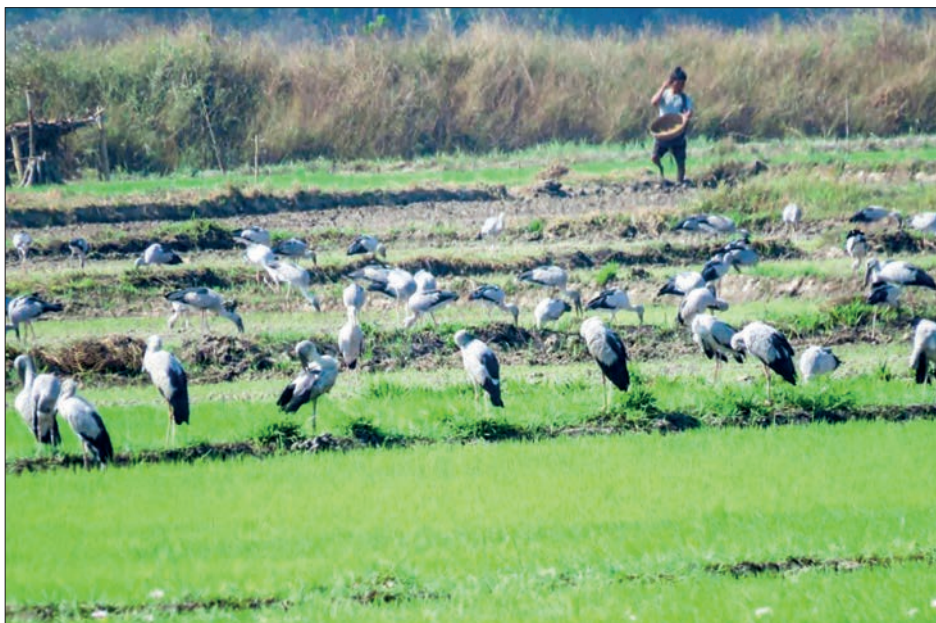
A section of the Kyonkapyin-Tapseik Wildlife Conservation Area, home to around 100 bird species, including endangered, rare, and resident varieties, thriving in their natural habitat.

A birdwatching programme has been launched in the Kyonkapyin-Tapseik Wildlife Conservation Area, located in Wakema Township, Ayeyawady Region. The initiative is being led by the Kyonkapyin-Tapseik Community Conservation Association (KTCCA), which aims to generate income for locals through tourism-linked biodiversity conservation efforts.