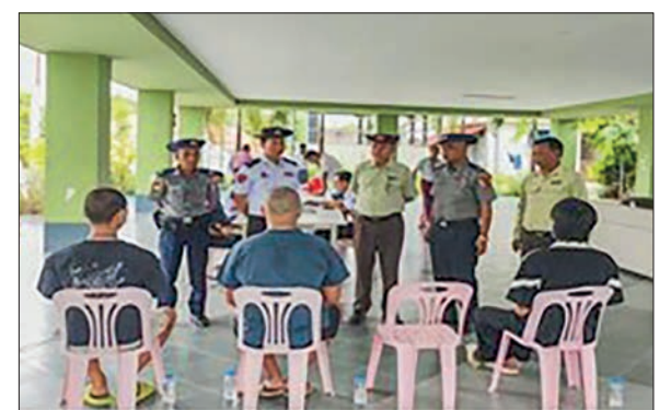
Immigration processes are underway for the deportation of undocumented foreign entrants.

Among the remaining 1,168 individuals to