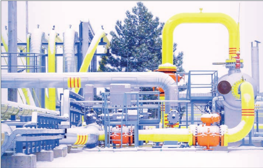
Slovakia will cover most part of its natural gas needs in 2026 through supplies from Russia.