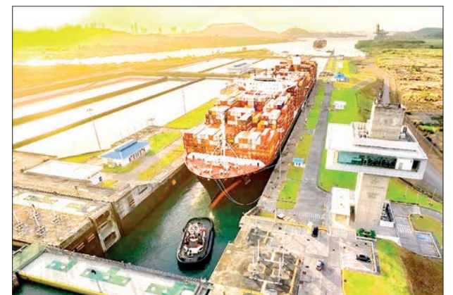
Projects aim to shield canal from geopolitics, stabilizing global trade.

On the oil front, S&P Global Energy noted that Indian refiners have been tactically navigating disruptions around the Strait of Hormuz to maintain domestic fuel security and preserve refining margins. — ANI