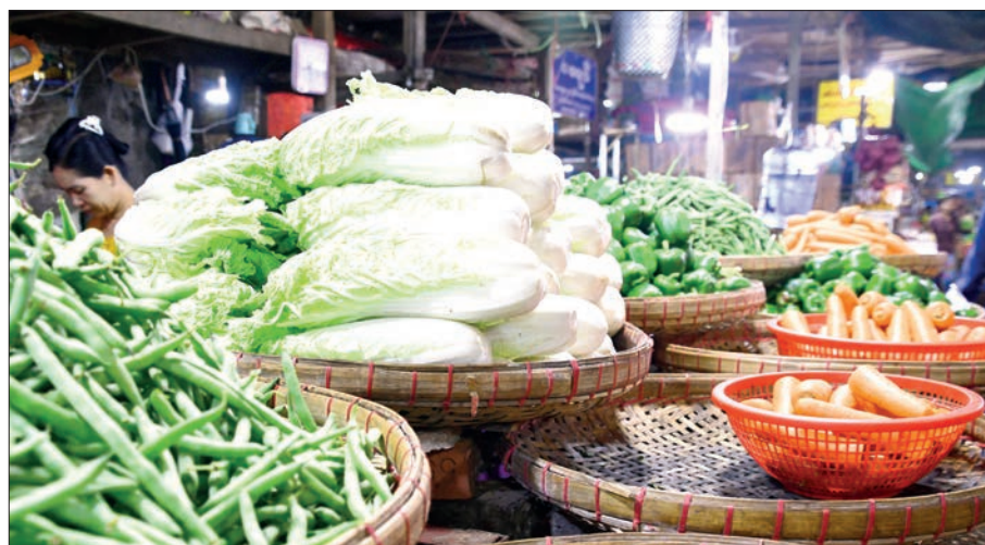
A vegetable stall at the New Thiri Mingala Market.

shwe Township and other townships in southern Shan State are actively participating in discussions with representatives of NOURISH Myanmar. This initiative aims to build resilient local market systems that enhance food security, improve nutrition outcomes and increase the incomes of rural communities.