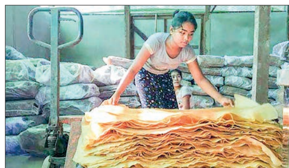
The photo shows weighing sundried rubber for packaging.

MFVP delivers direct and efficient B2B supply chain