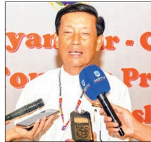
U Yan Win.

Before the President's visit to the People's Republic of China, discussions with Chinese diplomats included tourism-related matters. We believe tourism can significantly contribute to Myanmar's economy, and we expect tourism promotion to be among the topics discussed during the visit. Tourism has also declined in Thailand and Malaysia. Therefore, it is not surprising that Myanmar's tourism industry has experienced a downturn as well. However, the