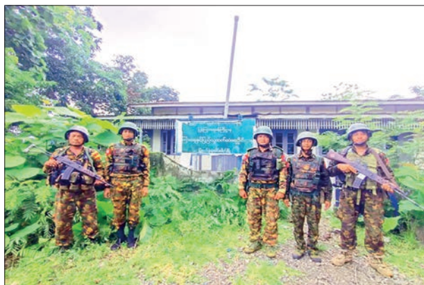
Triumphant Tatmadaw troops are seen following the restoration of control over the strategic Khampat town.

ed manner while carrying out phased security operations. Troops marching from Kalay recaptured the villages of Ashaygontha village, 56 th -Mile village, and 55 th -Mile village, which had been temporarily occupied by terrorist groups, on 7 June. Similarly, they also captured Nan Mootar, Yan Lin Paing and their vicinity areas in the same day, whereas Yazagyo village and Yazagyo dam on 13 June, Yan Myo Aung