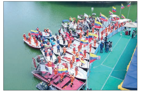
The drill is underway yesterday.

A water-based firefighting and search-and-rescue capability demonstration was held on the morning of 19 June at Kandawgyi Lake in Bahan Township, Yangon Region.