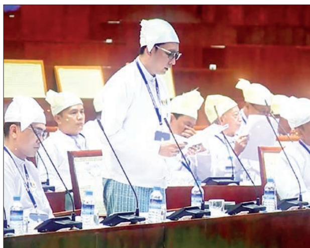
This image shows a session of the Third Yangon Region Hluttaw.

TO achieve full electricity access within Yangon Region, the expansion of power substations and transmission lines will be implemented each year, depending on the annual budget. This information