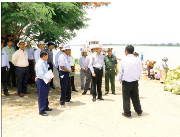
The Sagaing Region chief minister and officials inspect flood prevention and preparedness measures.

SAGAING Region Chief Minister U Ko Lay, together with regional ministers, inspected flood prevention and preparedness measures along the Chindwin River embankments in Monywa yesterday.