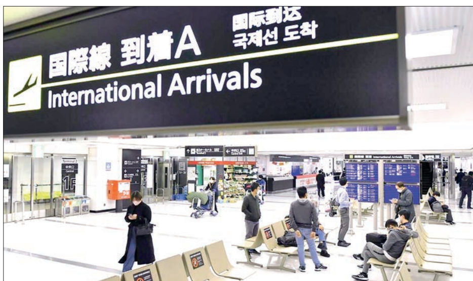
The price hikes will cover escalating infrastructure costs for automated immigration systems and managing a record-high foreign resident population.

"We do not expect the move to have an immediate impact on inbound tourism," Foreign Minister Toshimitsu Motegi said during a press conference. The hikes are expected to bring Japan's