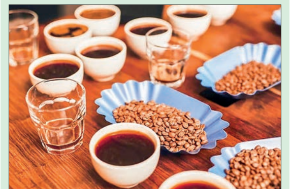
Myanmar coffee beans with tasting samples on display.

ing in collaboration with local people to conserve the area and conduct educational outreach. Thanks to increased local participation in these conservation efforts, the biodiversity in the area reportedly continues to flourish. — MT/ZN