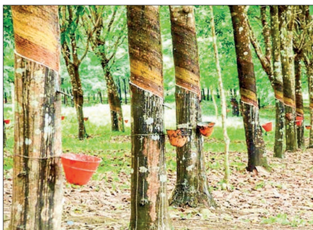
The picture indicates the rubber plantation and the latex from the stems of rubber trees.

Interested business entities can enquire for further details at the Supply and Logistics Division or by dialling 067 3410210 or 067 3410518. — NN/KK