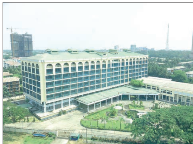
The Central Bank of Myanmar (CBM) in Yangon.

According to a CBM notification on 15 March 2024, the bank has been working with law enforcement agencies to combat and prosecute individuals attempting to manipulate the currency market under existing laws. Moreover, starting 5 December 2023, CBM allowed authorized dealers (private banks) to operate online foreign exchange trading freely, based on market rates determined by supply and demand. — NN/KK