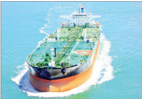
12.5 million barrels of oil transited through the Strait of Hormuz overnight, marking the highest volume since the start of the Iran conflict.

"The president's peace plan in Iran is already bearing real fruits for the American people. Last night, 12.5 million barrels of oil went through the Strait of Hormuz, which is a high since the beginning of the conflict," Vance said. He added that oil prices had nearly returned to pre-conflict levels, while gasoline prices had dropped below US$4 per gallon for the first time since the conflict began. He said, "Oil prices are down nearly to their level from the pre-war conflict, gas prices dropped below US$4 a gallon today for the first time since the conflict, and importantly, they're going to keep falling further given how low oil prices are." — ANI