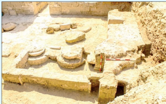
The primary construction of the temple ruins dates back to the Late Period (26 th Dynasty: 664-525 BC).

EGYPT announced on Friday a major archaeological discovery at the Al-Qasr Al-Qadim (Old Palace) Temple in Bahariya Oasis in the country's Western Desert, which uncovers significant architectural elements dating back around 2,500 years to the 26 th Dynasty (664-525 BC). The Egyptian Ministry of Tourism and Antiquities said in a statement that the Egyptian archaeological mission from the Supreme Council of Antiquities (SCA) uncovered the remains of a sandstone room, inscribed stone blocks bearing the names and titles of King Psamtik I, and various artifacts. The findings provide new evidence of the site's historical and religious significance, confirming its role as a key administrative center across successive eras, SCA Secretary-General Hisham Elleithy noted.