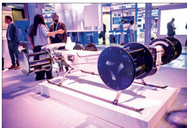
A CycloTech drone on display at the VivaTech fair.