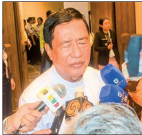
Union Minister U Maung Myint.

We organized the Mekong six-country forum to promote tourism. During the forum, participants exchanged information, discussed future cooperation plans, and explored opportunities for collaboration in the tourism sector. Myanmar and Cambodia also signed an agreement on bilateral tourism cooperation. Similar initiatives were undertaken before, but