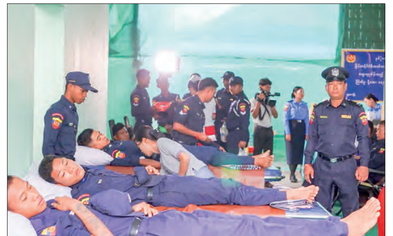
Firefighters donate blood in hailing the 80 th Fire Brigade Day.

On 30 April, the department's director, chairman and members of the disciplinary committee performed a water-pouring ceremony and cleaned the platform of the Eain Taw Yar Pagoda, donating K750,000.