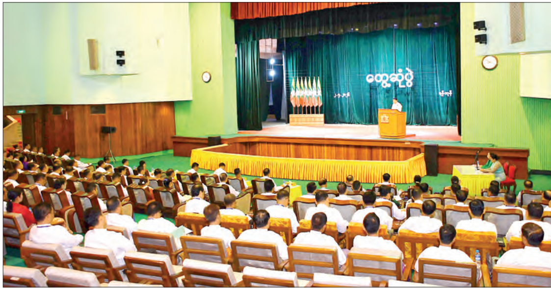
Pyithu Hluttaw Speaker U Khin Yi speaks at the meeting with Hluttaw representatives of the Pyithu Hluttaw, Amyotha Hluttaw and Region Hluttaw at the Yangon Region Hluttaw yesterday.

He added that when carrying out legislative duties, it is