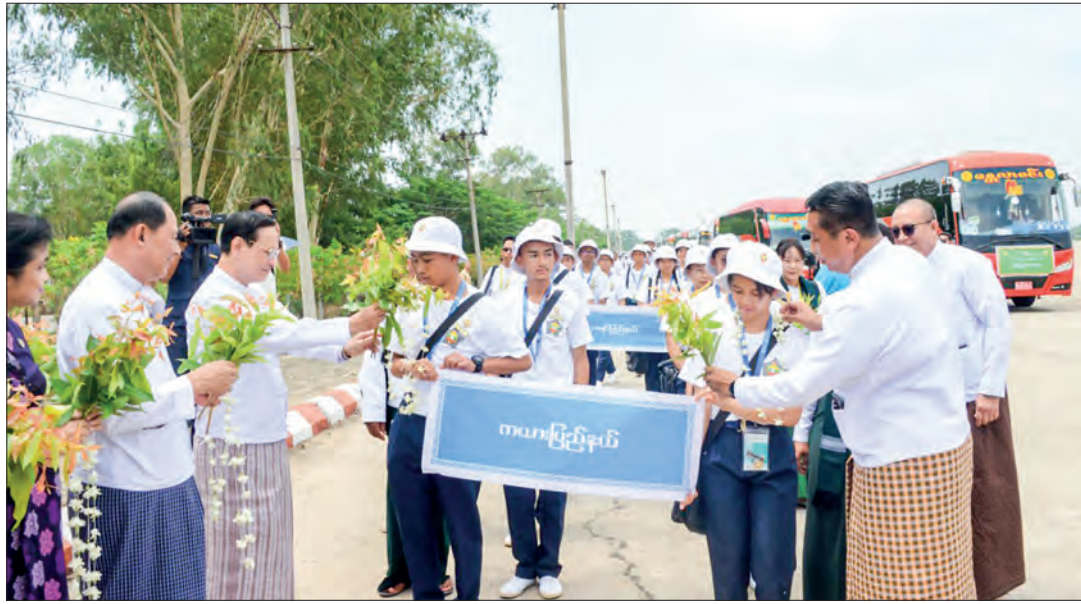
Luyeechun students (outstanding students) are welcome by officials from Ministry of Education at the Central Camp (Ywataw) in Nay Pyi Taw yesterday.

A total of 751 students and 102 supervisor teachers, including 96 Grade-9 students, 132 Grade-10 students, 133 Grade-11 students, 99 Grade-12 students, and 291 first- and second-year university students, who will visit student camps in PyinOoLwin, Inlay, Nay Pyi Taw, Ngwehsaung, and Chaungtha for the 2025-2026 academic year, arrived at the Central Camp (Ywataw) in Nay Pyi Taw yesterday morning.