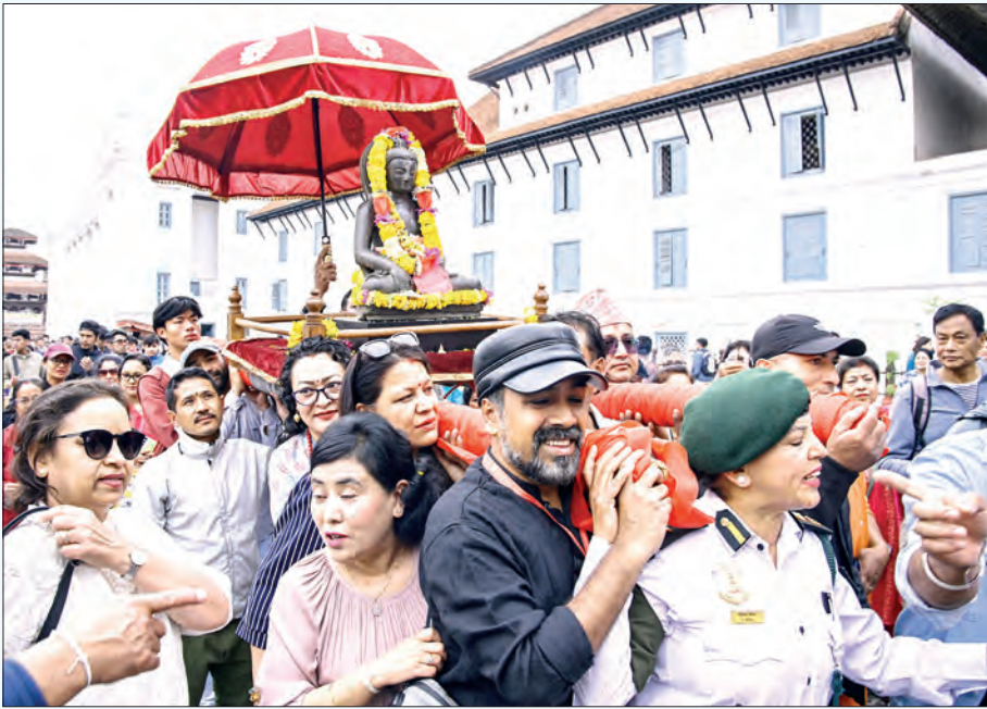
Devotees carry a sculpture of the Buddha to be reinstalled at a temple in Kathmandu on 1 May 2026.