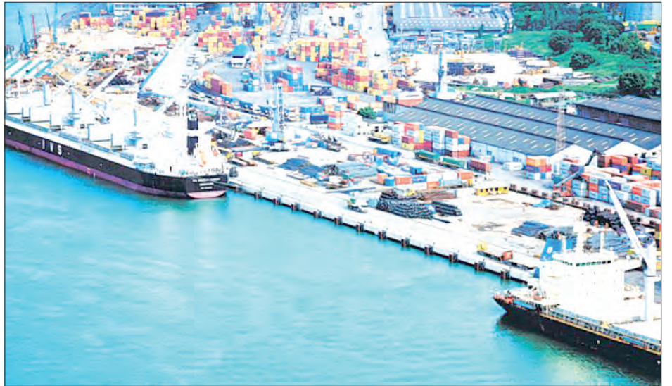
The Port of Dar es Salaam is one of three ocean ports in the country and handles over 90 per cent of the country's cargo traffic.

According to the Ministry of Commerce & Industry, "a comprehensive review of bilateral merchandise trade reflected steady and consistent