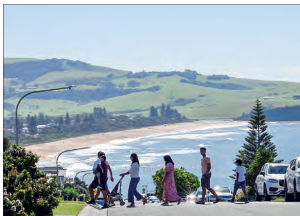
This picture taken on 27 April 2026 shows tourists visiting a street in Gerringong, about a two-hour drive south of Sydney.

Once a quiet hamlet, the area has seen coachloads of visitors arriving after Instagram, TikTok, and China's RedNote amplified its coastal views. Locals complain of tourists blocking roads, leaving rubbish,