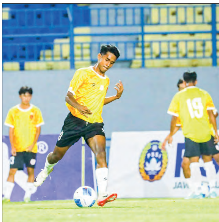
Myanmar U17 players are seen in a training session.

Under the competition format, the top two teams from each group will advance to the quarter-finals, and the eight quarter-finalists will qualify for the FIFA U17 World Cup. Myanmar, therefore, has a chance to secure its first-ever qualification for the U17 World Cup. — Ko Nyi Lay/KZL