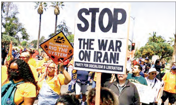
Demonstrators holding placards take part in a May Day rally in Los Angeles, California, the United States, on 1 May 2026.

cus on cooperation to strengthen supply chain resilience, promoting economic growth through shared rules, and on enhancing security cooperation for regional peace and stability. "In this challenging environment, it is essential for countries in the region to acquire 'resilience,'" she said, saying it is decisive in economic, social and security areas to allow countries to "determine their own future". — Kyodo