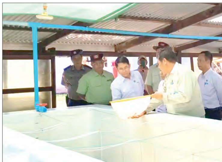
Union Minister U Min Naung observes the work process of freshwater shrimp hatchery of the Department of Fisheries in Kyauktan Township, yesterday.

He said that since the farms were established more than 23 years ago, they should be systematically upgraded to modern