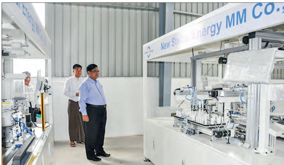
Union Minister Dr Charlie Than inspects the New Stellar Energy MM Co Ltd in Nay Pyi Taw.

The Union minister said that production plans must be drawn up based on market demand, with calculations for the number of batches to be produced for each type of drug. He added that the necessary pharmaceutical raw materials and packaging materials must be systematically prepared, along with production schedules, quality standards, and the management of remaining raw materials. He also said that procurement plans must be systematically prepared