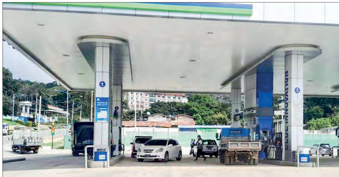
Vehicles are seen refuelling at the petrol station in downtown Yangon.

As per the statement, 90 per cent of fuel oil in Myanmar is imported, while the remaining 10 per cent is produced locally. Domestic fuel prices are highly correlated with international prices. The State is steering the market to mitigate the loss