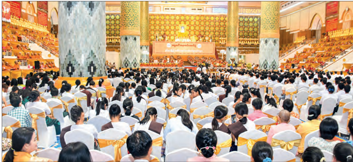
The auspicious gala ceremony to mark the 70 th Anniversary of the Sixth Buddhist Council celebrates the third day in the Maha Pasana Cave on Kaba Aye Hill in Yangon yesterday.