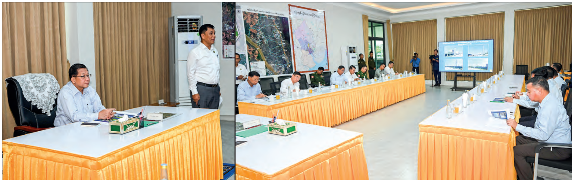
President U Min Aung Hlaing hears the reports on urban development activities during his inspection tour of Hlinethaya Township yesterday.