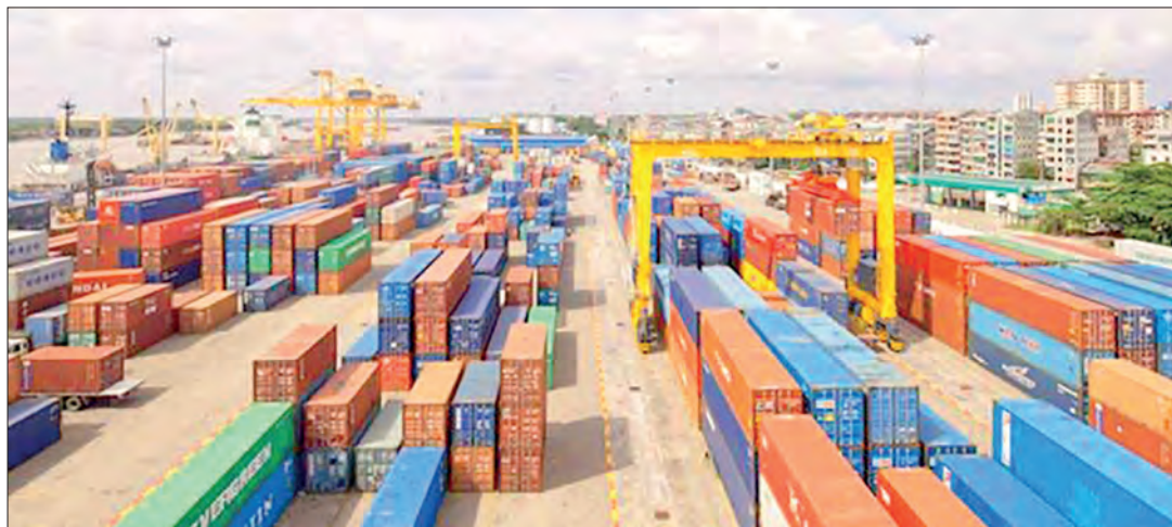
A bird's-eye view of a container yard with containers from shipping lines at Yangon Port along the Yangon River.

A total of 57 container vessels are scheduled to enter the Yangon Port in May 2026, the Myanmar Port Authority announced.