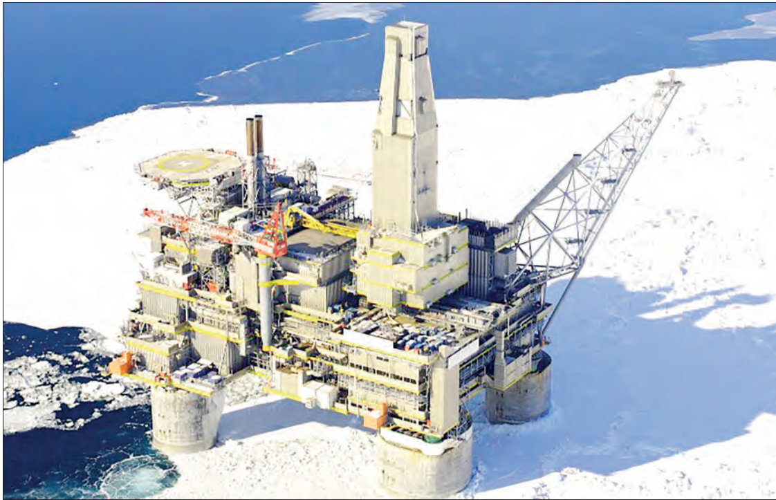
The Sakhalin-2 oil and natural gas development project is led by Russia's state-controlled energy giant Gazprom. The Piltun-B concrete gravity base production platform operating in the Russian Far East.

Gazprom leads the Sakhalin-2 energy project, with Japanese firms Mitsubishi and Mitsui as major stakeholders.