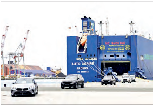
German auto exports to the US are facing severe disruption as of early 2026, with exports dropping nearly 14 per cent in the first three quarters of 2025 following increased tariffs.

Mueller urged Brussels and Washington to de-escalate and hold talks as soon as possible, calling on both sides to abide by their agreed trade rules. Posing on his Truth Social platform, Trump on Friday threatened to increase tariffs on cars and trucks imported from the European Union to 25 per cent starting next week. He justified the move by accusing the bloc of failing to comply with an agreed trade deal. — Xinhua