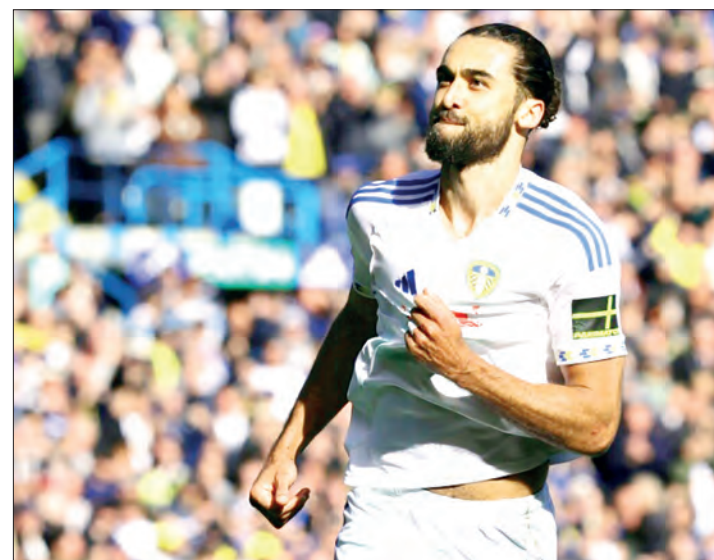
Dominic Calvert-Lewin scored in Leeds' win over Burnley.