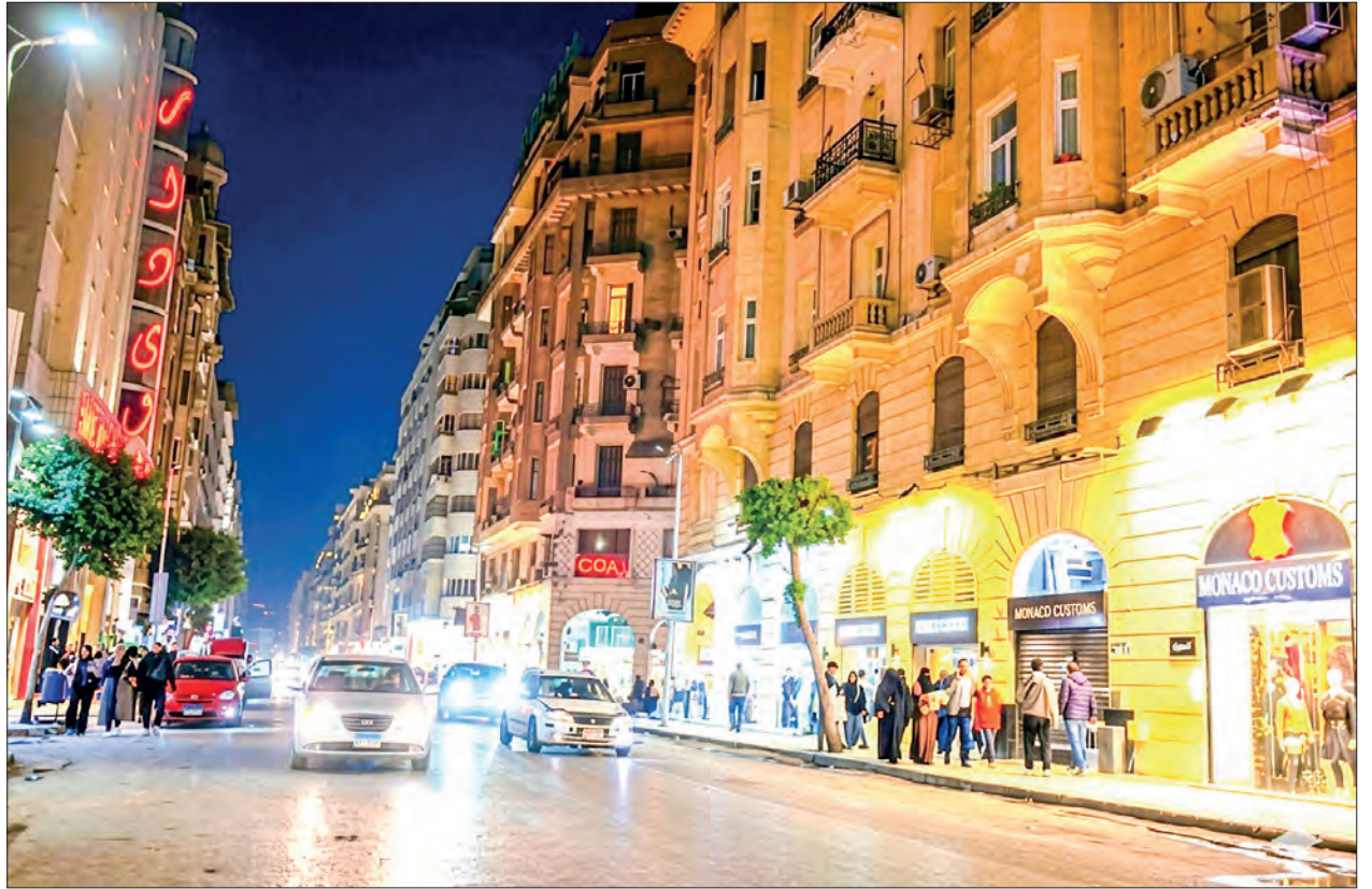
Cairo's famed nocturnal rhythm flickered back to life, after Egypt eased energy-saving measures.