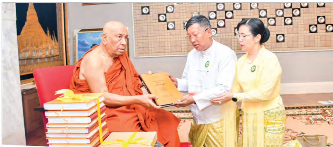
Union Minister for Religious Affairs U Tin Oo Lwin presents offerings to Sitagu Sayadaw Dr Ashin Nyanissara in Yangon yesterday.

UNION Minister for Religious Affairs U Tin Oo Lwin paid homage to senior monks from 14 countries attending the 70 th Anniversary of the Sixth Buddhist Synod, and presented them with offerings.