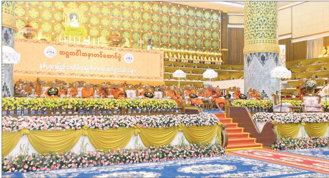
The Union minister and his wife, and officials, offer Dhamma gifts and books to venerable Sayadaws and nuns.

Professor of State Pariyatti Sasana University (Yangon)