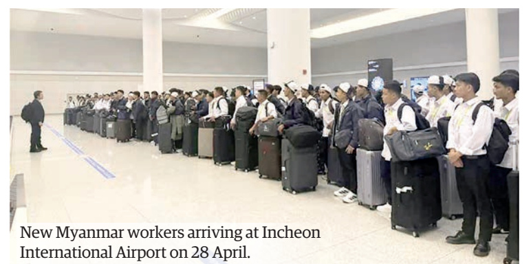
New Myanmar workers arriving at Incheon International Airport on 28 April.