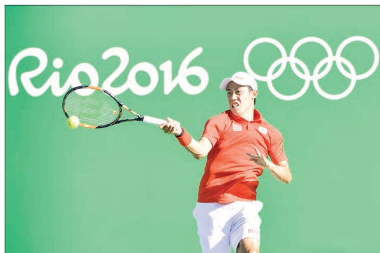
File photo shows Kei Nishikori of Japan playing a forehand en route to winning his bronze-medal match against Spain's Rafael Nadal at the Rio de Janeiro Olympics on 14 August 2016.

JAPANESE tennis icon and former world No 4 Kei Nishikori said on social media Thursday that he will retire at the end of the season.