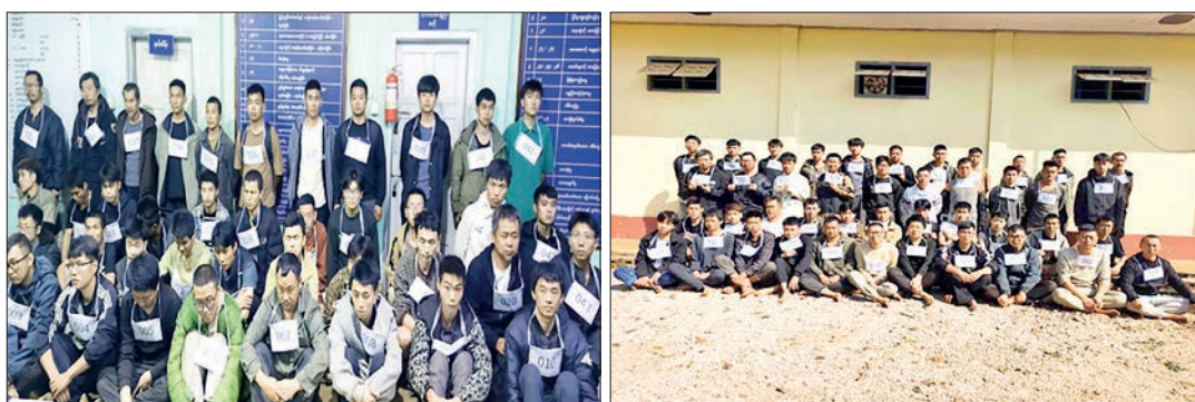
Images at top and above show the detention site of 43 undocumented Chinese nationals arrested near Wammai Village in Kali, Kunhing Township.

AUTHORITIES arrested 43 foreign nationals illegally residing in Myanmar near Wammai Village, Kali, Kunhing Township, yesterday.