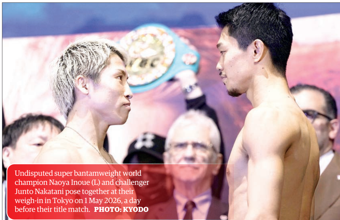
Undisputed super bantamweight world champion Naoya Inoue (L) and challenger Junto Nakatani pose together at their weigh-in in Tokyo on 1 May 2026, a day before their title match.

"I want this to be the fight that makes people say 'Naoya Inoue was a legend,'" said Inoue, who indicated he was ready to vary his game plan depending on how the fight unfolds. — Kyodo