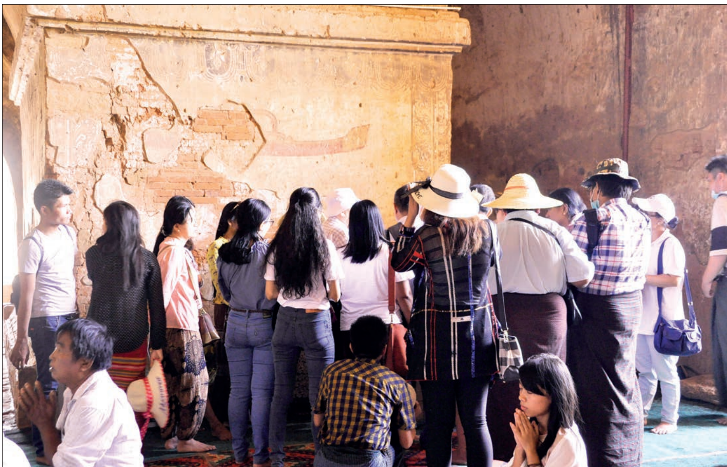
University students and researchers are seen closely studying mural paintings in the pagodas and temples of the Bagan Ancient Cultural Heritage Zone.

During the Bagan era, mural paintings were created on the walls and ceilings of pagodas, temples, and caves. Durable pigments were developed and applied to the walls. Even when the surface layer has faded over time, the underlying paintings can still be seen today. Researchers have also recognized and praised the techniques used to prepare pigments during both the early and late Bagan periods. — Thitsa (MNA)/MKKS