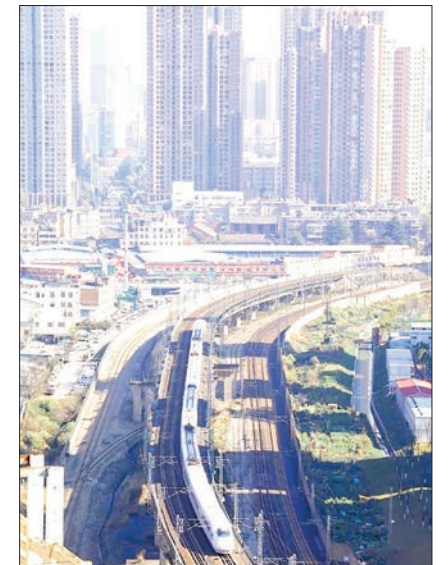
A bullet train runs in the city of Kunming, southwest China's Yunnan Province, 15 February 2026.

Road trips are expected to reach 315.24 million, marking a 3.2 per cent increase from the same period last year. Railways are forecast to handle 24.8 million passenger trips, up 7.3 per cent year on year, and waterways are expected to see 1.73 million trips, marking a 4.9 per cent increase. — Xinhua