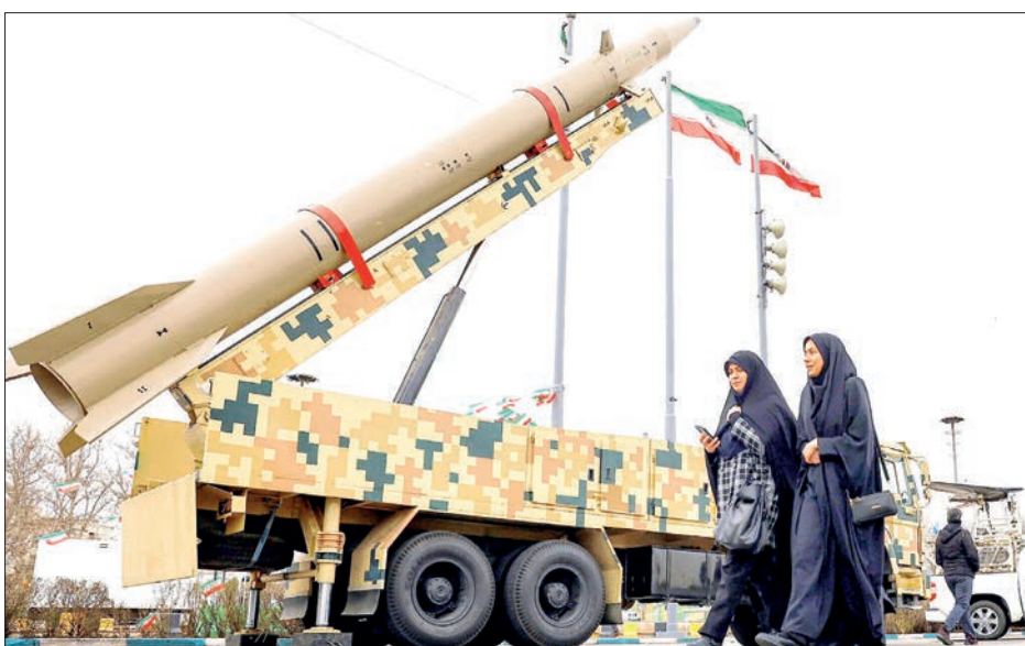
Women walk past a ballistic missile launch vehicle in Tehran on 11 February 2026, during a rally marking the 47th anniversary of the 1979 Islamic revolution.

This clandestine rearmament effort follows a sharp diplomatic escalation at the United Nations, where Amir Saeid Irvani, Iran's Permanent Representative, hit back at six Arab nations. — ANI