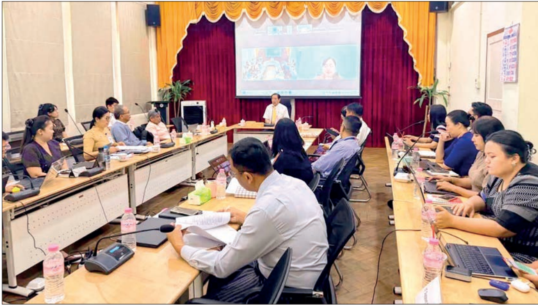
The Heatwave and Monsoon Season Preparedness (Pre-Disaster) Meeting is underway at the Myanmar Red Cross Society Yangon Branch on 28-29 April 2026.

THE Myanmar Red Cross Society (MRCs), in collaboration with the International Federation of Red Cross and Red Crescent Societies (IFRC), held a Heatwave and Monsoon Season Preparedness (Pre-Disaster) Meeting in a hybrid format at the MRCs Yangon Branch on 28 and 29 April.