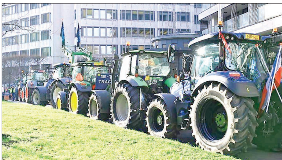
It is a protest against the proposed cuts to subsidies for the Common Agricultural Policy (CAP) in the EU's new budget plan for the 2028-2034 period. "Tractors block a street during a farmers' protest near the Europa Building in Brussels, Belgium, 18 December 2025.