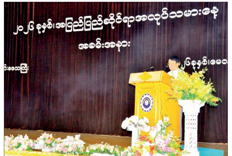
Union Minister U Khin Maung Soe reads out the congratulatory message from President Agga Maha Thray Sithu Agga Maha Thiri Thudhamma U Min Aung Hlaing at yesterday's International Workers' Day event.

Subsequently, the Union minister met officers and staff members of the training school and instructed them to systematically draft and implement skill training and assessment programmes that meet labour market demands and enable trainees to become truly proficient, while emphasizing that the courses should be effective, practical, and supportive of national economic development, and highlighting the importance of promoting green skills and green jobs to protect the environment and facilitate a transition from technical proficiency to sustain-