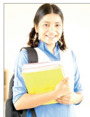
Indian girls now outnumber boys in education across school, postgraduate, and MPhil programmes.

Girls' enrolment has also reached or surpassed boys in