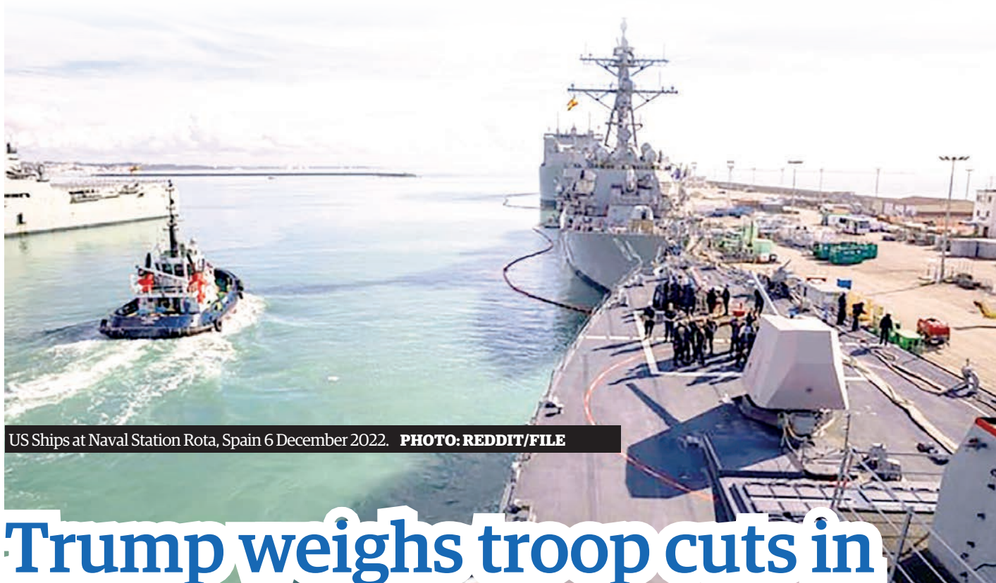
US Ships at Naval Station Rota, Spain 6 December 2022.