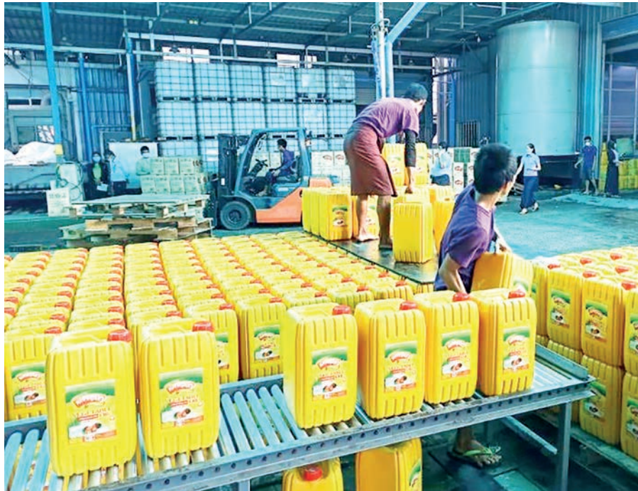
Workers are seen organizing jerrycans of cooking oil for distribution and sale.

The Supervisory Committee on Edible Oil Import and Distribution under the Ministry of Commerce has been closely observing the FOB prices in Malaysia and Indonesia, adding transport costs, tariffs and banking services to decide the wholesale market reference rate for edible oil weekly. Despite the reference price, the market price is still high. To control overcharging, the Consumer Affairs Department under the Ministry of Commerce informed consumers of lodging complaints for overcharging through the call centre hotline in late August. The department urges consumers not to buy palm oil at high prices.