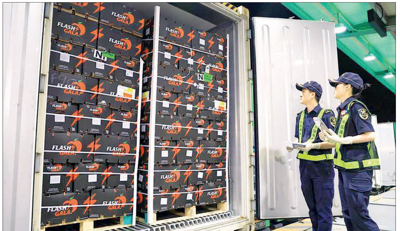
Customs officers inspect imported apples to be cleared under the expanded zero-tariff treatment to all 53 African nations at night at Shenzhenwan Port in Shenzhen, south China's Guangdong Province, 30 April 2026.

China's commerce ministry said in a statement that the zero-tariff policy will lend a competitive edge to African products. — Xinhua