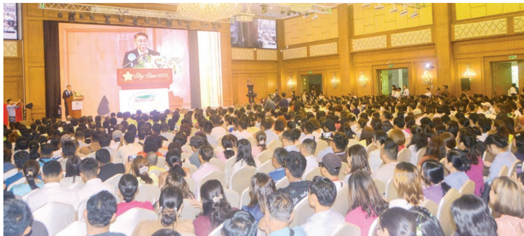
The opening ceremony of a multiplier training programme on AML/CFT & FATF-related knowledge for real estate agents is underway in Yangon yesterday.

THE Myanmar Real Estate Services Association (MRESA) held the opening ceremony of a multiplier training programme on AML/CFT and FATF-related knowledge for real estate agents at Sky Star Hotel in Tamway Township, Yangon, yesterday morning.