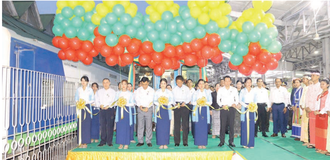
The launching ceremony of modern air-conditioned DEMU trains on the Yangon-Mandalay section is in progress yesterday.

Inauguration ceremonies were held at the Yangon Railway Station and Mandalay Railway Station yesterday