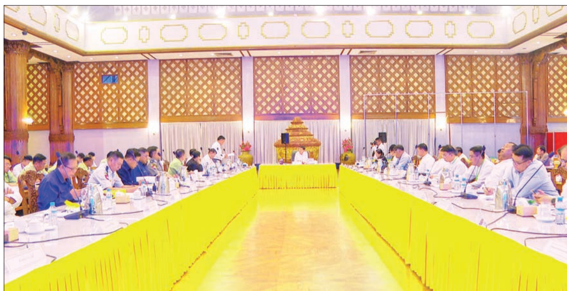
Union Minister U Mya Tun Oo chairs the meeting on systematic installation of telecommunication and power cables in Yangon Region yesterday.

The Union minister stressed that relevant departments and communication companies have to cooperate in the systematic installation of cables. As the underground cable network connections already implemented along Pyay Road are functioning well, the project must be continued as planned along Kaba Aye Pagoda Road and Waizayanta Road. The Union minister guided the communication network expansion