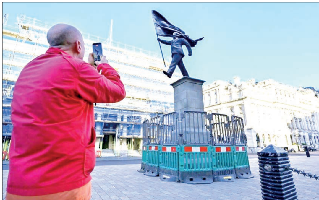
The statue suddenly appeared in central London. PHOTO: AFP

The appearance of the statue comes just over a month after a Reuters investigation claimed to have confirmed the artist's true identity. — AFP