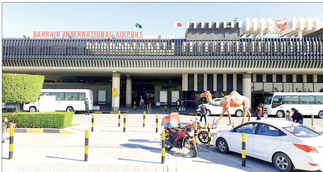
Bahrain International Airport.

AIR India Express, India's first international value carrier, has announced the reinstatement of operations to Qatar and Bahrain, along with additional flights to the UAE, Oman and Saudi Arabia, starting 30 April. Flights have resumed from major Indian metros and regional gateways, including Amritsar, Bengaluru, Delhi, Hyderabad, Jaipur, Kochi, Kozhikode, Kannur, Lucknow, Mangaluru, Mumbai, Tiruchirappalli, Thiruvananthapuram and Varanasi. Air India Express will continue operating to Al Ain, Abu Dhabi, Dubai, Ras Al Khaimah, Sharjah, Jeddah, Riyadh and Muscat, with the reinstatement