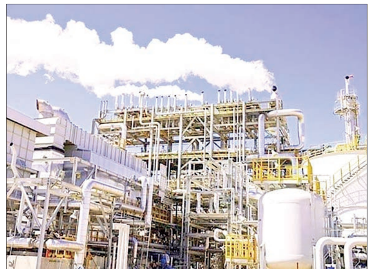
The photo shows a view of installations of an oil refinery.

She added that with the UAE now looking to increase its production capacity to five million barrels per day by 2027, OPEC+ is likely to have "lower significance" in the global market, although it will still remain a powerful player. — ANI