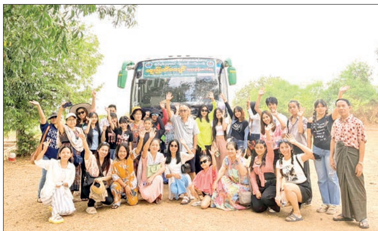
Visitors at Zalattaw.

In particular, beaches and resorts, which can offer a natural and cosy environment for relaxation, have been more popular. In addition to Chaungtha and Ngwehsaung beaches, Kyaukhnyat, Zalattaw and Sal Eain Tan are popular day-trip destinations for tourists who wish to go for