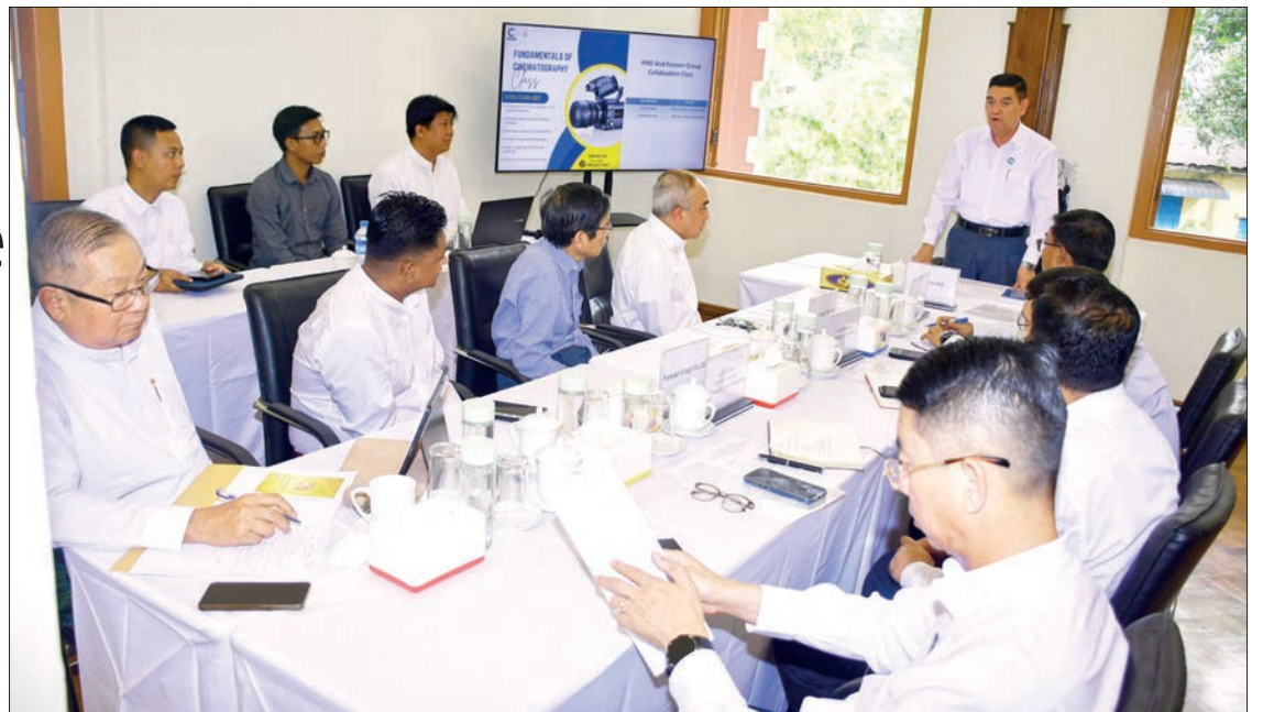
Union Information Minister U Htein Lin is seen during his inspection tour of Wazira Cinema and his meeting with Motion Pictures Censorship Board yesterday.

During the meeting, the Union minister said he had a warm meeting with censor members working to ensure that Myanmar films, foreign films, online films, television-broadcast foreign films, and foreign films and series with Myanmar subtitles are screened in accordance with the Motion Pictures Law as well as the Television and Video Law,