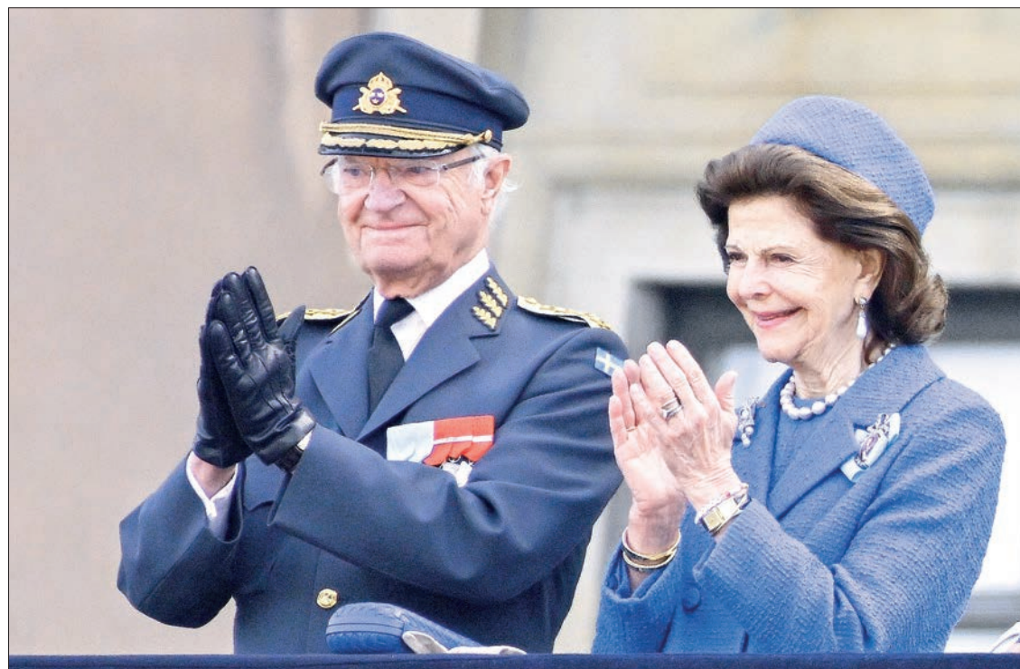
Sweden's King Carl XVI Gustaf (L) and Sweden's Queen Silvia applaud from the balcony as members of the Swedish Armed Forces pay tribute to the King at the Outer Courtyard of the Royal Palace in Stockholm, Sweden, on 30 April 2026, during celebrations to mark the 80 th birthday of Sweden's King Carl XVI Gustaf.

It was to be followed by a military honour guard, a flypast over the palace and a royal salute and a choral tribute before a lunch at City Hall. A banquet was to be held in the evening, with a number of European royals and dignitaries invited, as well as Thailand's royal couple.