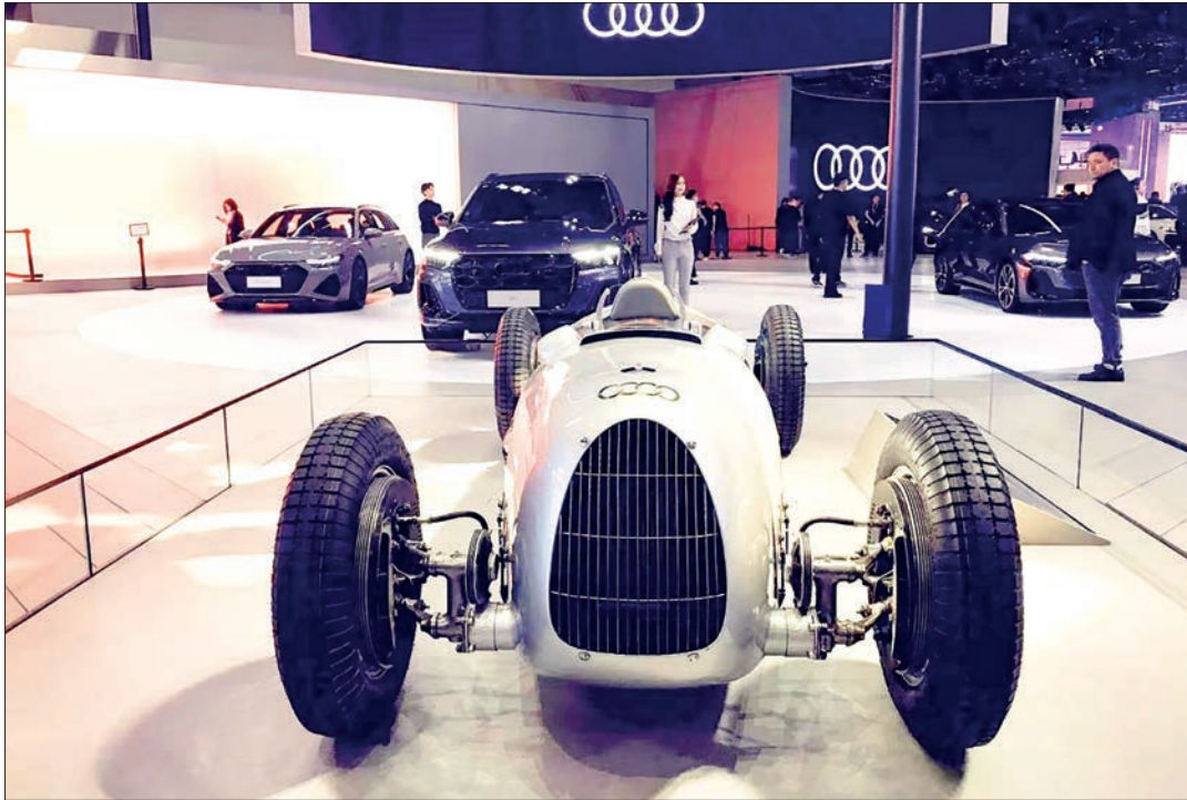
This photo, taken on 24 April 2026, shows the Audi booth at the 2026 Beijing International Automotive Exhibition.