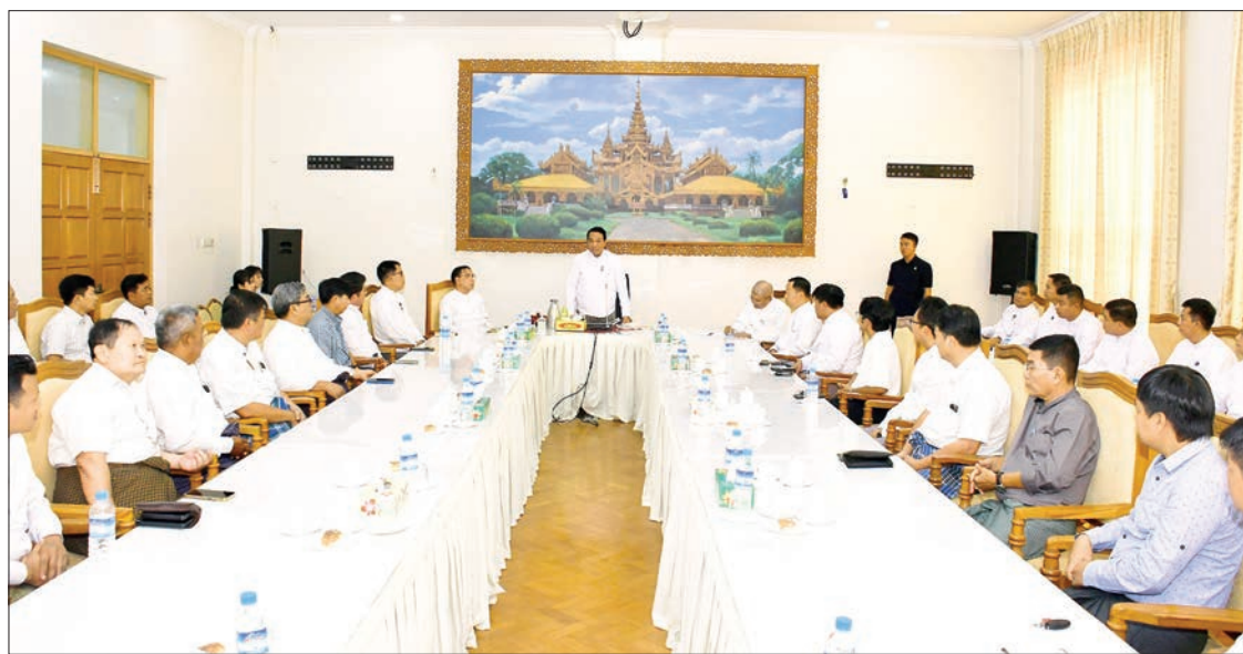
Pyithu Hluttaw Speaker U Khin Yi meets representatives of the Pyithu Hluttaw, Amyotha Hluttaw and Region Hluttaw in Bago Region yesterday.

Moreover, the Speaker noted that in serving the duties of legislative measures, the Hluttaw representatives have to verify all measures, whether existing laws conform with the current period, need to be amended, revoked or revised for promulgation, and these laws can protect the people.