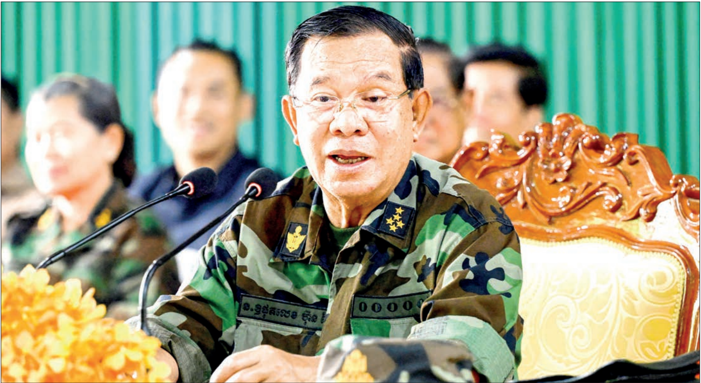
This pool photo taken and released on 26 June 2025 by Agence Kampuchea Presse (AKP) shows Cambodia’s Senate President Hun Sen delivering a speech during his visit to Cambodian armed forces stationed along the border with Thailand in Oddar Meanchey province on 26 June 2025. PHOTO: AFP/FILE

S AMDECH Techo Hun Sen, president of the ruling Cambodian People’s Party, said on Wednesday that the kingdom is committed to strictly and fully implementing a ceasefire with Thailand to restore peace for both nations. Hun Sen, also president of the senate, said restoring peace between Cambodia and Thailand will also contribute to peace, security, stability, and prosperity in the region. “Cambodia expresses its deepest gratitude to all friendly countries and the international community, particularly the United States, the People’s Republic of China, and ASEAN member states under the coordination of Malaysia as the ASEAN Chair, for their active assistance and participation in seeking this peaceful solution,” he said. Cambodia and Thailand agreed to an immediate ceasefire on 27 December 2025, after three weeks of armed conflict that caused casualties on both sides. — Xinhua