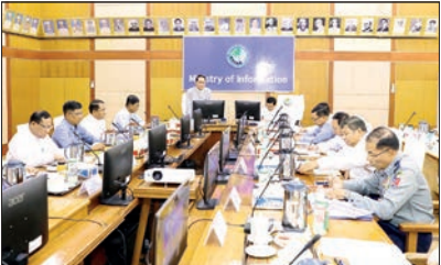
Myanmar Film Academy Awards to launch in Feb 2026