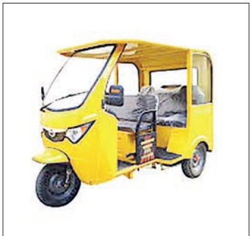
This image illustrates a three-wheel motorbike powered by fuel oil.

Those businesses will create 415 jobs for locals. The committee members inspected general issues of 17 companies, including an increase in the labour force of one company (430 jobs). The regional investment committee has been endorsing investment projects in accordance with rules and regulations under the Myanmar Investment Law to spur investments and create more job opportunities. — ASH/KK