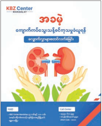
An infographic from the KBZ Centre Mandalay regarding the application process for free kidney dialysis treatment.

treatment history, and the physician's referral letter. All submitted applications will be systematically reviewed by a board of specialist doctors, and selected patients will be contacted directly during the last week of January. — MT/ZN