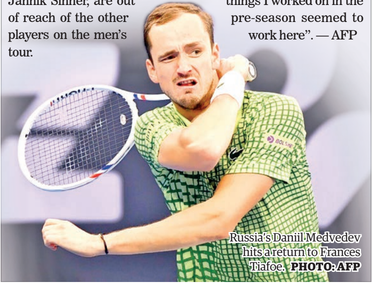
Russia’s Daniil Medvedev hits a return to Frances Tiafoe.

But he also said that anything could happen at a Grand Slam and he has shown in the first two rounds in Brisbane that he will be one of the challengers when the Australian Open starts on 18 January. “I’m really happy with the way I played the two matches,” said Medvedev, a three-time beaten finalist at the Melbourne major. “It’s kind of continuing what I started doing at the end of the last year, already playing better and better. “But these two matches (this week) I think were even better and I’m happy that some things I worked on in the pre-season seemed to work here”. — AFP tour.