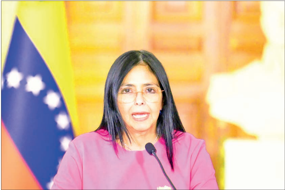
Venezuela's acting president Delcy Rodriguez was a staunch supporter of her ousted boss, Nicolas Maduro.

Venezuelans remain steadfast defending nation after bombardment.