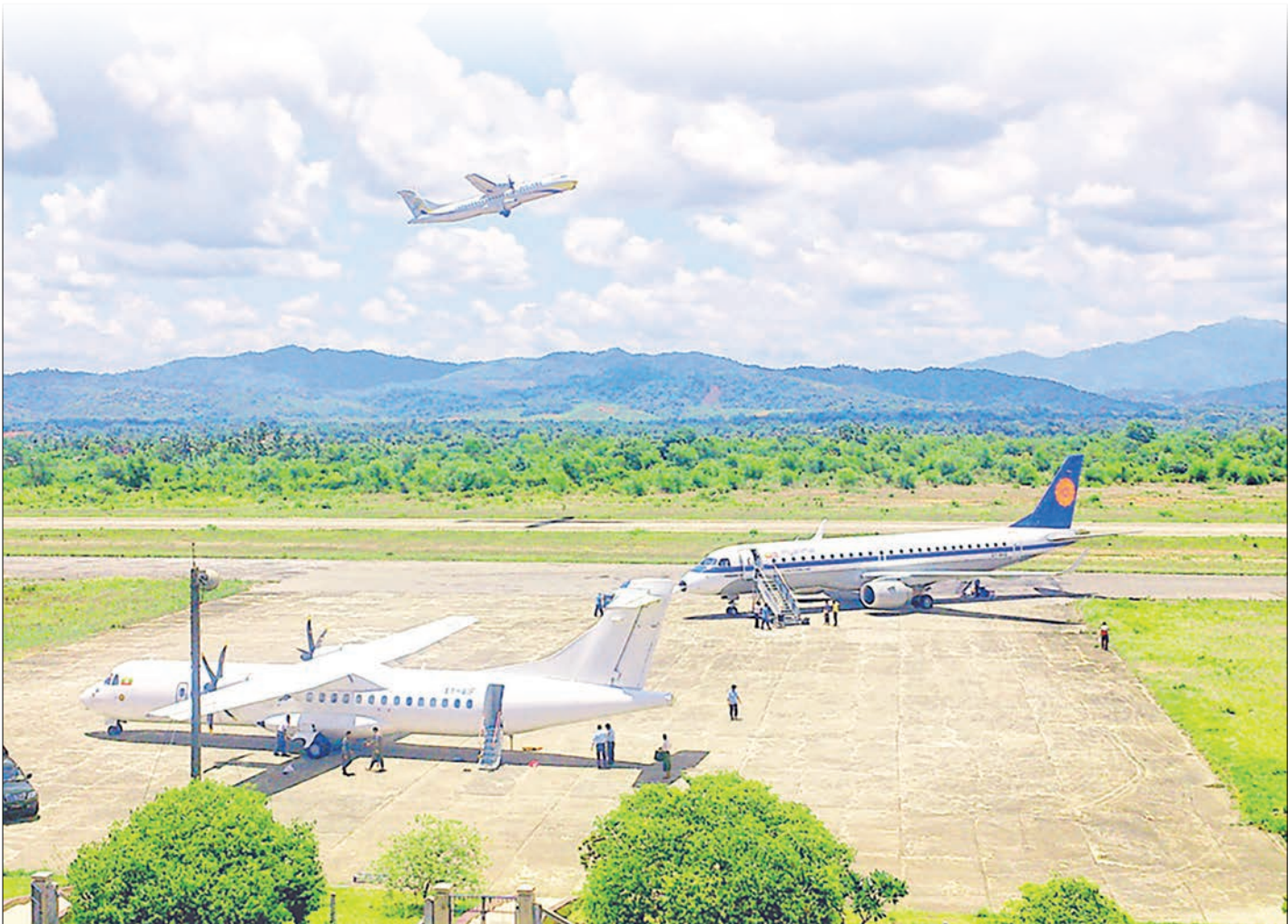
This photo captures the ongoing upgrade work at Dawei Airport.

Dawei Airport features a 12,000-foot-long, 100-foot-wide runway across 364.677 acres, with three parking areas capable of accommodating up to five domestic aircraft simultaneously.