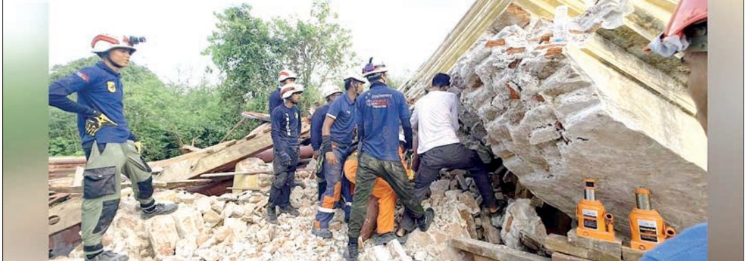
This photo reveals rescue workers and volunteers helping in search and rescue efforts during the earthquake.

THE Fire Services Department under the Ministry of Home Affairs has announced that commendation certificates have been awarded to 200 charitable organizations, including auxiliary fire units, in recognition of their dedicated efforts in search and rescue operations during the Mandalay earthquake.