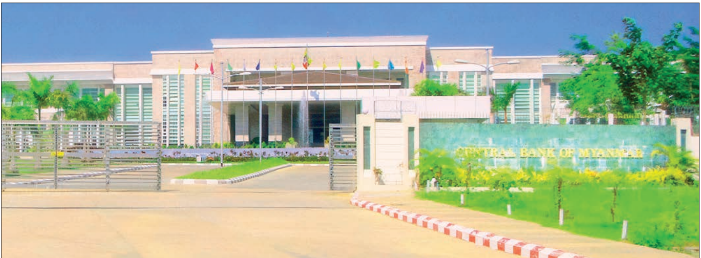
The facade of the Central Bank of Myanmar (head office) in Nay Pyi Taw.

A work coordination meeting on the implementation of the rice export zone and paddy seed processing development was held on 5 January 2026 at Office 15 in Nay Pyi Taw. The meeting highlighted procedures to develop rice export zones jointly implemented by the Department of Agriculture, Ministry of Agriculture, Livestock and Irrigation and Myanmar Rice Federation, with initial project areas of 340,000 acres, agricultural contributions of K450,000 per acre to farmers involved in the zone, a harvest plan and a roadmap for sustainable agricultural growth in accordance with the State policies and guidelines. MRF also contributed K1.25 billion in capital expenditure to a leading group for the protection of farmer rights and the enhancement of their benefits, and discussed detailed plans for paddy seed production on 5,000 acres. — NN/KK