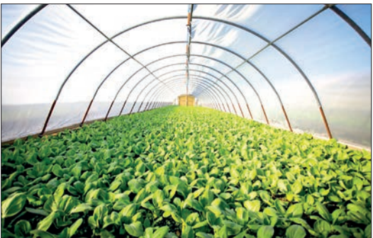
Biofertilizers are natural formulations containing living or latent microorganisms that enhance soil fertility by making essential nutrients more available to plants.

bio-based chemicals, regenerative medicine and precision diagnostics, he said. — Xinhua