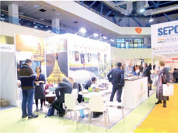
Myanmar's tourism booth at the 25 th Moscow International Travel and Tourism Exhibition.

THE Union of Myanmar Travel Association (UMTA) has planned to conduct a tourism digital marketing training course to enhance the use of digital marketing technologies for the tourism sector. For the training project,