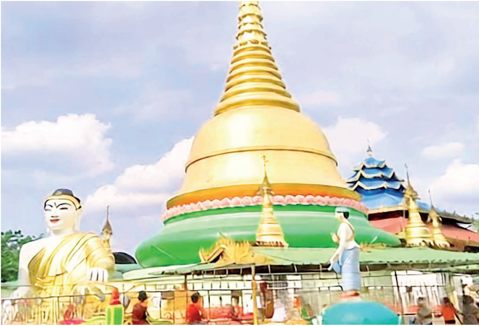
My visit to the Mei-la-mu Pagoda Festival was a memorable and enjoyable experience.

I reached the top of Kittar Road near Phonegyi Lan busstand. There were many entertainments such as merry-go-rounds, Pirate Boat, an artificial playground only for the children, Ferris wheel, etc., at this junction. I saw some children playing merrily on the artificial playground "Happy World" while their parents stood looking carefully at their movements until time was up. Fun railway services for children add-