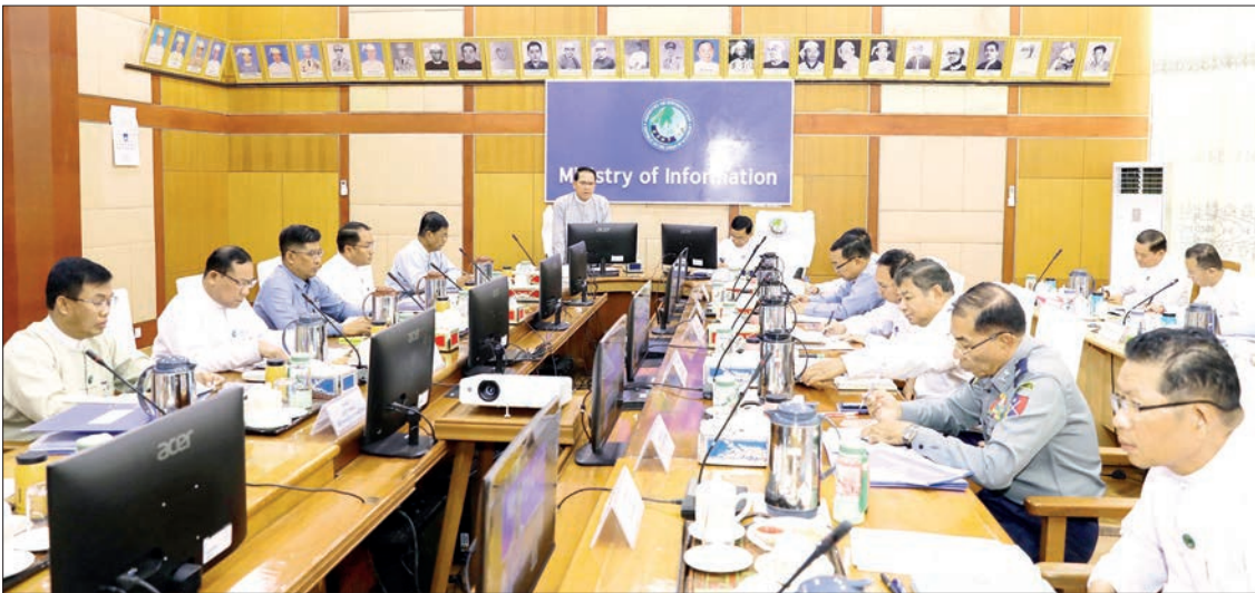
Union Minister for Information U Maung Maung Ohn speaks at the coordination meeting on the organizing of the 2025 Myanmar Film Academy Awards Ceremony in Nay Pyi Taw yesterday.

UNION Minister for Information U Maung Maung Ohn presided over the coordination meeting on the successful holding of the 2025 Myanmar Film Academy Awards Ceremony yesterday in Nay Pyi Taw. During the meeting, the Union minister mentioned that the awards ceremony would be held on 7 February 2026 in Nay Pyi Taw, detailing the examination processes for the selected films by the award selection subcommittee, better arrangements for the event with Forever Group Company Limited, and proper cooperation to be able to hold the event grandly and successfully. The attendees reported on the work being alone by their respective subcommittees and ongoing work plans for the event, and the Union Minister concluded the meeting. — MNA/ KTZH