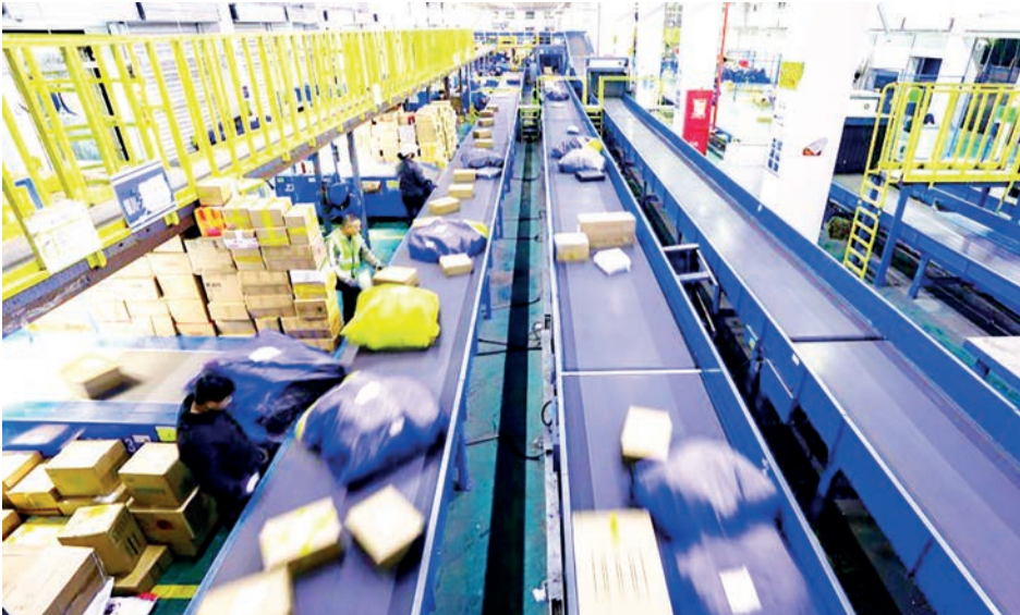
Staff members sort parcels at a management center of ZTO Express in Helan County, Yinchuan, northwest China’s Ningxia Hui Autonomous Region, 11 November 2025.

Paramount amended its hostile takeover bid in mid-December to include an over-$40 billion personal financing guarantee from tech titan Larry Ellison, an ally of US President Donald Trump. Ellison’s son David is the CEO of Paramount Skydance, which controls the historic Hollywood studio as well as a host of TV groups, including CBS. — AFP