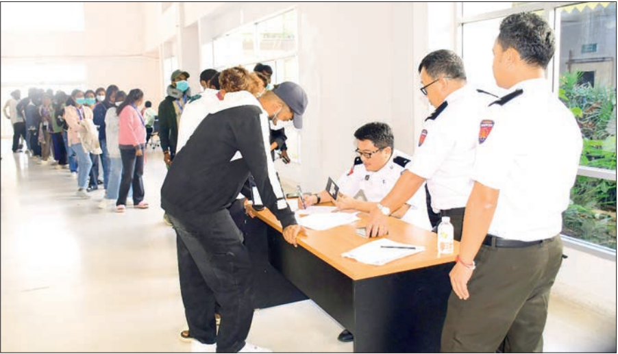
This photo displays Myanmar Immigration processing the deportation of foreign immigrants.

THE year 2025 will be the oldest model to be issued an import permit for non-commercial vehicles under Section 13 (B) of the Export and Import Law, according to Notification 120/2025 regarding the 2026 vehicle import released by the Ministry of Commerce. The model year must be 2025 and 2026 for non-commercial vehicles. Public service vehicles such as mini-buses, city buses, express buses and commercial trucks manufactured in 2022 and later can be imported. Moreover, fire trucks and ambulances manufactured in 2017 and later are allowed for import. The oldest model of machinery is set for 2017. Except for machinery, all import vehicles must be left-hand drive under the 2026 vehicle im-