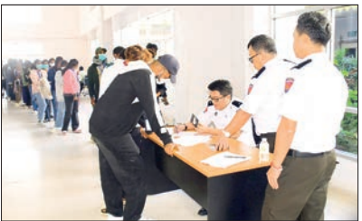
227 foreigners involved in telecom fraud deported