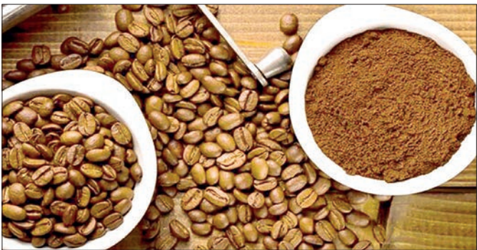
High-quality Myanmar export coffee.

THE Department of Agriculture notified those who remained to pay property tax for buying and selling the coffee project areas in PyinOoLwin need to make payment by 15 January,