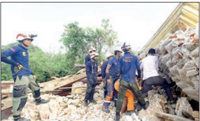
FSD honours 200 volunteer groups for rescue efforts during Mandalay earthquake