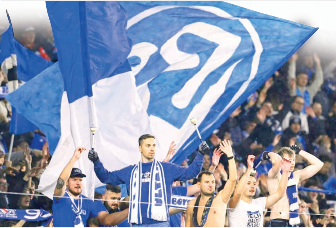
Strasbourg supporters were left enraged after their promising young coach Liam Rosenior moved to fellow BlueCo club Chelsea.

THE departure of Strasbourg coach Liam Rosenior to take over as Chelsea manager has exposed the harsh realities of multi-club ownership, which is gaining ground across the world but causing discord between supporters and teams. The relatively inexperienced Rosenior, 41, has achieved a remarkable elevation from the modest French Ligue 1 side to the World Club Cup champions, who are both owned by American Todd Boehly’s BlueCo consortium.