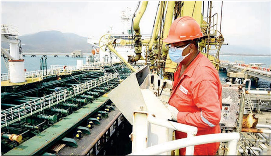
A worker from Petroleos de Venezuela operates machinery in front of the Fortune oil tanker, docked at the El Palito Refinery, Carabobo state, Venezuela.

Earlier on Tuesday night, US President Donald Trump announced that the interim authorities in Venezuela would turn between 30 and 50 million barrels of sanctioned oil to the United States and said that while the oil will be sold at its market price, the money will be controlled by US President to ensure it is used to benefit the people of Venezuela and the United States. — ANI