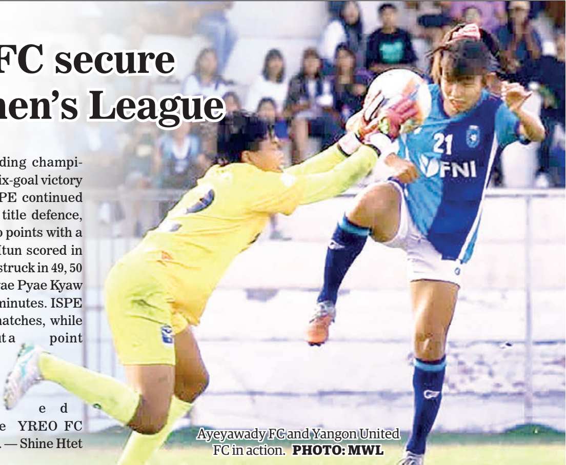
Ayeyawady FC and Yangon United FC in action.

Centre Ground 1, defending champions ISPE FC recorded a six-goal victory over Yangon City FC. ISPE continued to apply pressure in the title defence, trailing Ayeyawady by two points with a game in hand. Shwe Yi Htun scored in 36 minutes, Lin Myint Mo struck in 49, 50 and 70 minutes, and Su Pyae Pyae Kyaw added goals in 55 and 80 minutes. ISPE have 28 points from 11 matches, while Yangon City remain without a point after 12 matches. Matchday XXX-III continues today at the Yangon United Sports Complex, where YREO FC will face Thitsa Arman FC. — Shine Htet Zaw/KZL