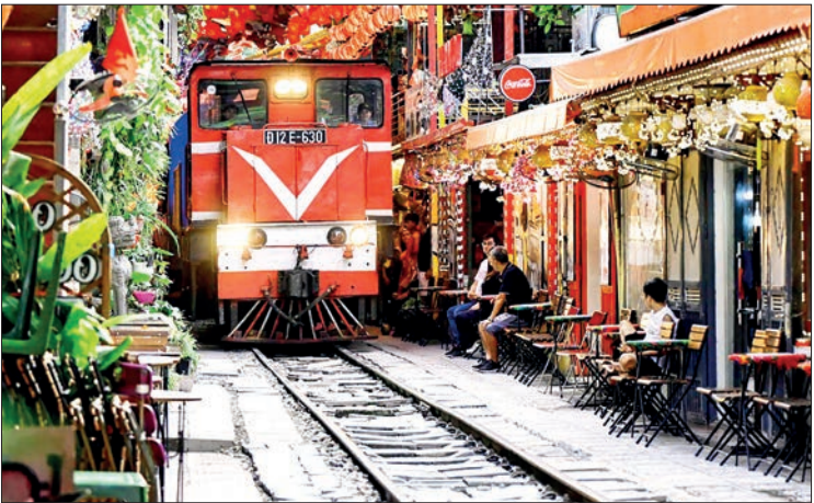
Authorities of Vietnam’s capital Hanoi have proposed suspending passenger train services running through the city’s well-known railway cafe street.

inner-city neighbourhoods and the popular cafe-lined area, according to the report. Located along the railway, the railway cafe street has attracted thousands of visitors every day despite repeated bans and the installation of physical barriers, local media reported. — Xinhua