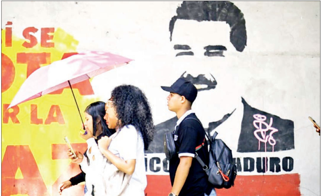
People walk past a mural depicting now ousted Venezuelan president Nicolas Maduro near the National Assembly in Caracas