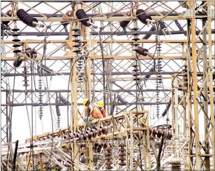
India’s power sector is expected to see a year of recovery without a sharp rebound in demand, according to a report on India Power Outlook 2026 by Bernstein.

On the supply side, India added a record 41 GW of power capacity in FY26 till November, and total additions for the fiscal year are expected to reach around 55 GW. This includes approximately 42 GW of renewable capacity and about 9 GW of thermal capacity. The report says that renewable capacity additions are expected to moderate in FY27 to around 35 GW due to slower tendering, grid constraints and reduced government support. Thermal capacity additions are expected to continue at about 8 GW in FY27. — ANI