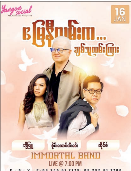
This image shows a poster for the music concert titled “Myaynilan Ka Chitthu Lankyar”, dedicated exclusively to selected songs by Sai Htee Saing.

port policy. Heavy equipment that cannot be driven on public roads such as excavators, bulldozers, wheel loaders, vibratory rollers, clamp loaders, motor graders, road roller compactors, bridge cranes, gantry cranes, tower cranes, pilling machines, crawler drills and cranes, overhead travelling cranes, mobile cranes, rough-terrain cranes, forklifts, boom lifts and asphalt finishers are allowed to be brought into the country as long as they are 15 years old or less. The ministry issues the specified model year for vehicle importation yearly. The existing automobile import policies are not modified, the notification stated, as stated by the Commerce Ministry. — NN/KK