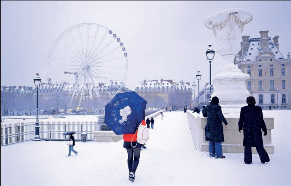
A pedestrian walks with an umbrella next to the Jardin des Tuileries covered in snow in Paris on 5 January 2026.