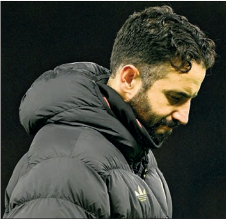
Manchester United's Portuguese head coach Ruben Amorim reacts at the end of the English Premier League football match between Manchester United and Wolverhampton Wanderers at Old Trafford in Manchester, north west England, on 30 December 2025.

Current under-18s coach Darren Fletcher will take charge of the team against Burnley on Wednesday. — AFP