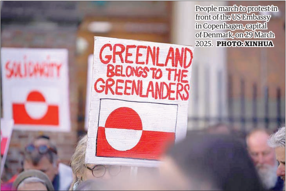
People march to protest in front of the US Embassy in Copenhagen, capital of Denmark, on 29 March 2025.

urging Washington to stop making threats against a close ally and the Greenlandic people.