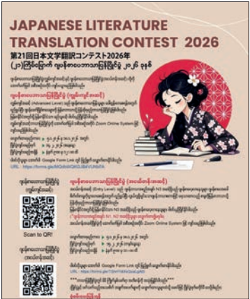
This image shows an invitation poster for the 21 st Japanese Literature Translation Contest.

UNION Minister for Education Dr Chaw Chaw Sein received Mr Bounphieng Chanthavong, Ambassador of the Lao People's Democratic Republic to Myanmar, at the reception hall of the Ministry of Education in Nay Pyi Taw yesterday afternoon. The two sides held open and cordial discussions on expanding areas of mutually beneficial cooperation between the two countries, enhancing collaboration in student exchange programmes, and further strengthening bilateral cooperation in the education sector in the future. The meeting concluded with the exchange of commemorative gifts. The meeting was also attended by Deputy Minister for Education U Nay Myo Hlaing, Director-General of the Department of Higher Education Dr Than Zaw Oo, and officials from the Ministry of Education. — MNA/MKKS