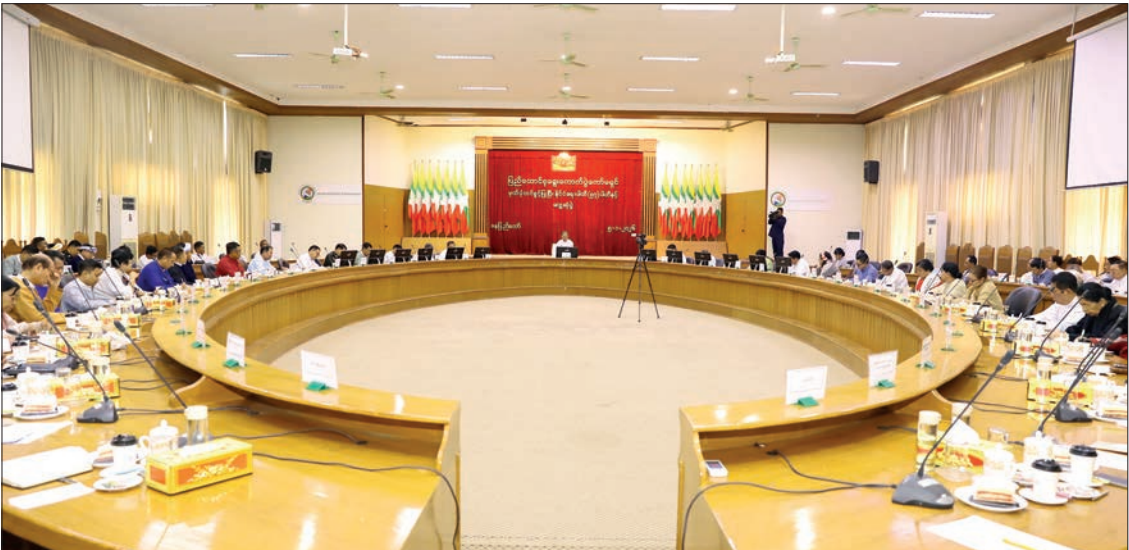
The meeting between the UEC Chairman and political parties is underway in Nay Pyi Taw yesterday.