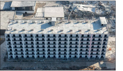
Govt pushes ahead with demolition of illegal buildings in Shwe Kokko and KK Park