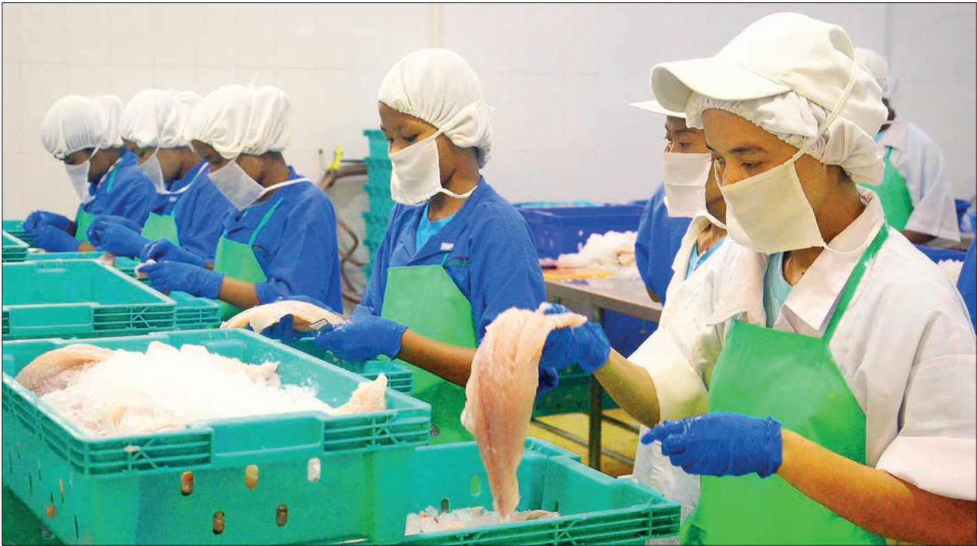
Workers are seen processing fishery products designated for exportation.

Myanmar exports more than 300 varieties of fishery products to over 40 countries, with its seafood steadily reaching markets in Japan, the Middle East, European Union member states, Malaysia, Chinese Taipei and Australia.