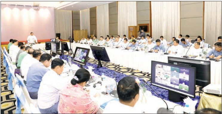
Union Minister Lt-Gen Yar Pyae addresses the third coordination meeting of the Steering Committee on Holding Youth Peace Forum.

THE third coordination meeting of the Steering Committee on Holding Youth Peace Forum was held in Nay Pyi Taw yesterday. It was attended by Union Minister Lt-Gen Yar Pyae, who is also Chairman of the committee, Union Minister for Information U Maung Maung Ohn, who is the Committee Vice-Chair, National Solidarity and Peacemaking Negotiation Committee (NSPNC) Secretary Lt-Gen Min Naing, committee members, deputy ministers, and permanent secretaries, while social affairs ministers from regions and states joined via videoconferencing. Speaking at the event, Union Minister Lt-Gen Yar Pyae said the importance of the role of youth in peace will be illustrated through the upcoming Youth Peace Forum. The forum will help identify and nurture qualified youth for nation-building,