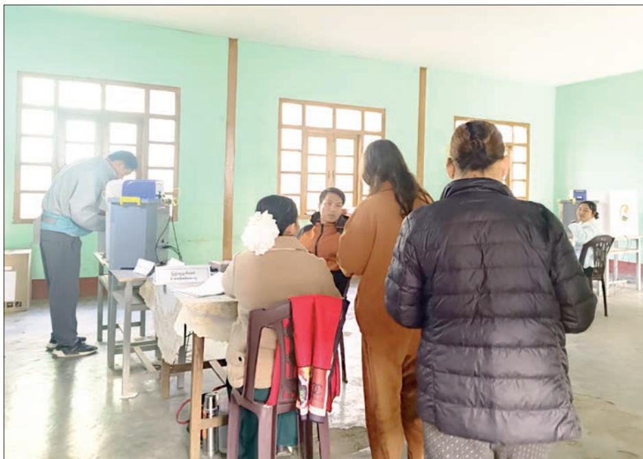
Nawngkhio residents are seen casting their votes on 28 December 2025.

Take, for instance, the 1951 poll – Myanmar's first founding elections. It took place at a time when the country was encountering multiple insurgencies that had immediately followed Myanmar's independence in 1948.