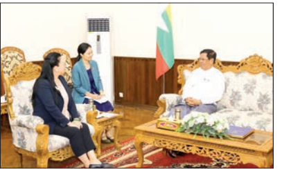
MoFA Union Minister receives Chinese Ambassador