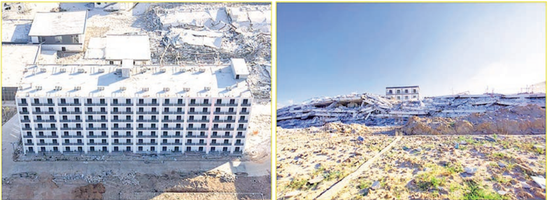
An illegally built five-storey flat is seen in the KK Park area before and after demolition.

THE government of Myanmar manages the combined team comprising security forces, administrative bodies and local authorities to raid illegal buildings in Shwe Kokko and KK Park areas, where telecom fraud and online gambling activities are operated, and systematically dismantle the confiscated materials and illegal buildings used in the online scams and gambling activities. Yesterday, the combined team dissolved 26 more illegal buildings – five one-storey buildings, 15 two-storey buildings, four three-storey buildings, and two five-storey buildings used in telecom fraud and online gambling activities in the Myawady-Maethawtalay (KK Park) area. Therefore, a total updated number of 610 buildings out of 635 illegal buildings have been demolished in Section 2 of the KK Park area. To destroy the illegal buildings within Section 3 of KK Park area, these buildings were demolished using machinery and fire barrels starting from 14 December, and as of yesterday, five more four-storey buildings have been destroyed, and a total of 106 buildings have been totally destroyed. The government considers the eradication of telecom fraud and online gambling crimes as a national responsibility and, to ensure that such activities can no longer operate within Myanmar, will continue its efforts in coordination not only with domestic forces but also with the governments of neighbouring countries. — MNA/MKKS