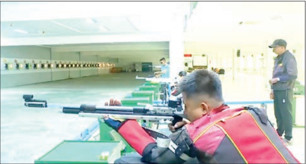
Team Myanmar shooting players are pictured participating in the previous ASEAN Para Games.

YOUNG striker Gonzalo Garcia scored a hat-trick as Real Madrid kept track of FC Barcelona at the top of La Liga with a comfortable 5-1 home win over Real Betis on Sunday.