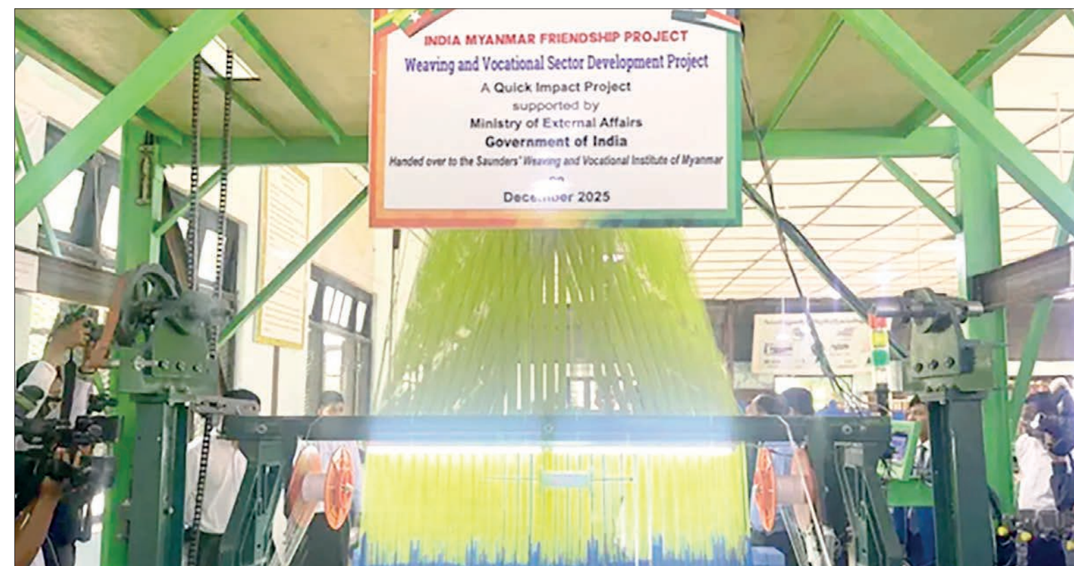
A flexible rapier loom weaving machine from India was provided under the QIP scheme.

(Views expressed in the article belong solely to the author.)