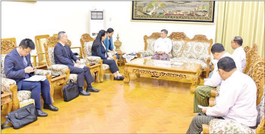
Union Minister U Chit Swe receives Chinese Ambassador Ms Ma Jia yesterday.

Discussions with the Lao Ambassador also focused on increasing exports of