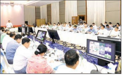
Youth Peace Forum aims to nurture qualified youths for nation-building