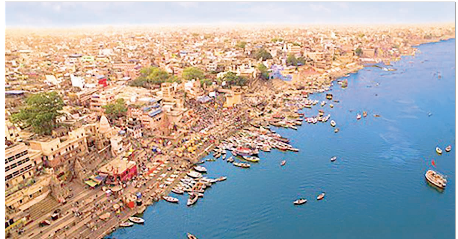
Dashashvamedh Ghat at the banks of the Ganga in Varanasi, India.

The value of QIPs lies in their clarity of purpose and speed of delivery. A modest solar-water supply system sustains a round-the-year water supply for village households and for agricultural plantations and livestock, especially through dry months in water-scarce areas, turning subsistence plots into surplus income sources. Expressing the community's gratitude for one such QIP in Magyisaunt village in Mandalay region, a local villager shared, “I am very thankful to the Government of India and the Dry Zone Greening Department for their collaboration in donating water, as this is incredibly helpful not only for the residents of Magyisaunt Village, Mandalay