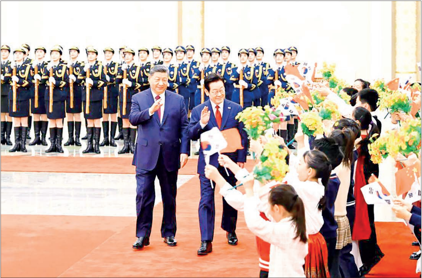
Chinese President Xi Jinping holds a welcome ceremony for President of the Republic of Korea (ROK) Lee Jae Myung in the Northern Hall of the Great Hall of the People prior to their talks in Beijing, capital of China, 5 January 2026. Xi held talks with Lee, who is on a state visit to China, at the Great Hall of the People in Beijing on Monday.

CHINESE President Xi Jinping held talks with President of the Republic of Korea (ROK) Lee Jae Myung in Beijing on Monday. Xi said he and President Lee have met twice and conducted reciprocal visits, reflecting the importance both sides attach to China-ROK relations. As both friends and neighbours, China and the ROK should increase exchanges and maintain frequent communication. China has consistently placed relations with the ROK high on its regional diplomatic agenda and maintained continuity and stability in its policy towards the ROK, Xi said, adding that China is willing to work with the ROK to firmly uphold the direction of friendly cooperation, adhere to the principle of mutual benefit and win-win outcomes, promote bilateral strategic partnership along a healthy path, effectively enhance the well-being of both peoples, and contribute positively to regional and global peace and development. Xi said the fourth plenary session of the 20 th Central Committee of the Communist Party of China reviewed and adopted the recommendations for formulating the 15 th Five-Year Plan, outlining a blueprint for China's development over the next five years and offering broad opportunities for countries worldwide. China and the ROK share close economic ties with industrial and supply